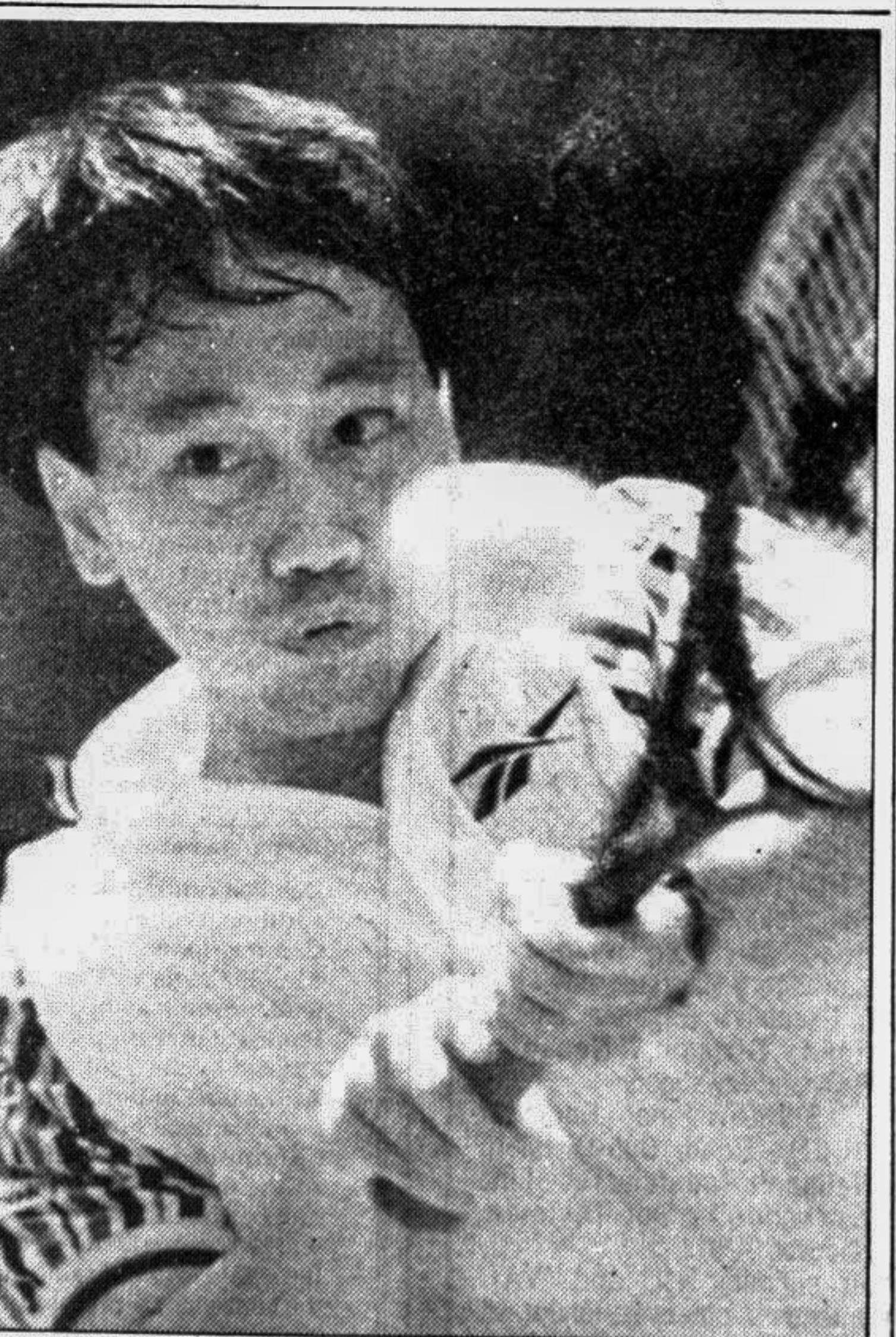
World No three Michael Chang of the United States plays a backhand return against Kenneth Carlsen of Denmark in Melbourne yesterday. Chang won 6-3, 7-6, 5-7, 6-3.