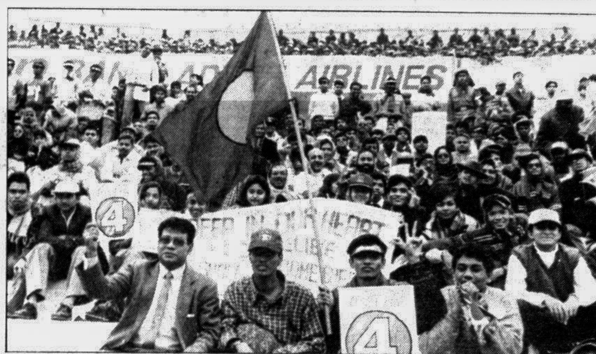
Onlookers at the packed Dhaka Stadium during a match in the Coca-Cola Independence Cup tri-nation cricket tournament which ended on Jan 18.