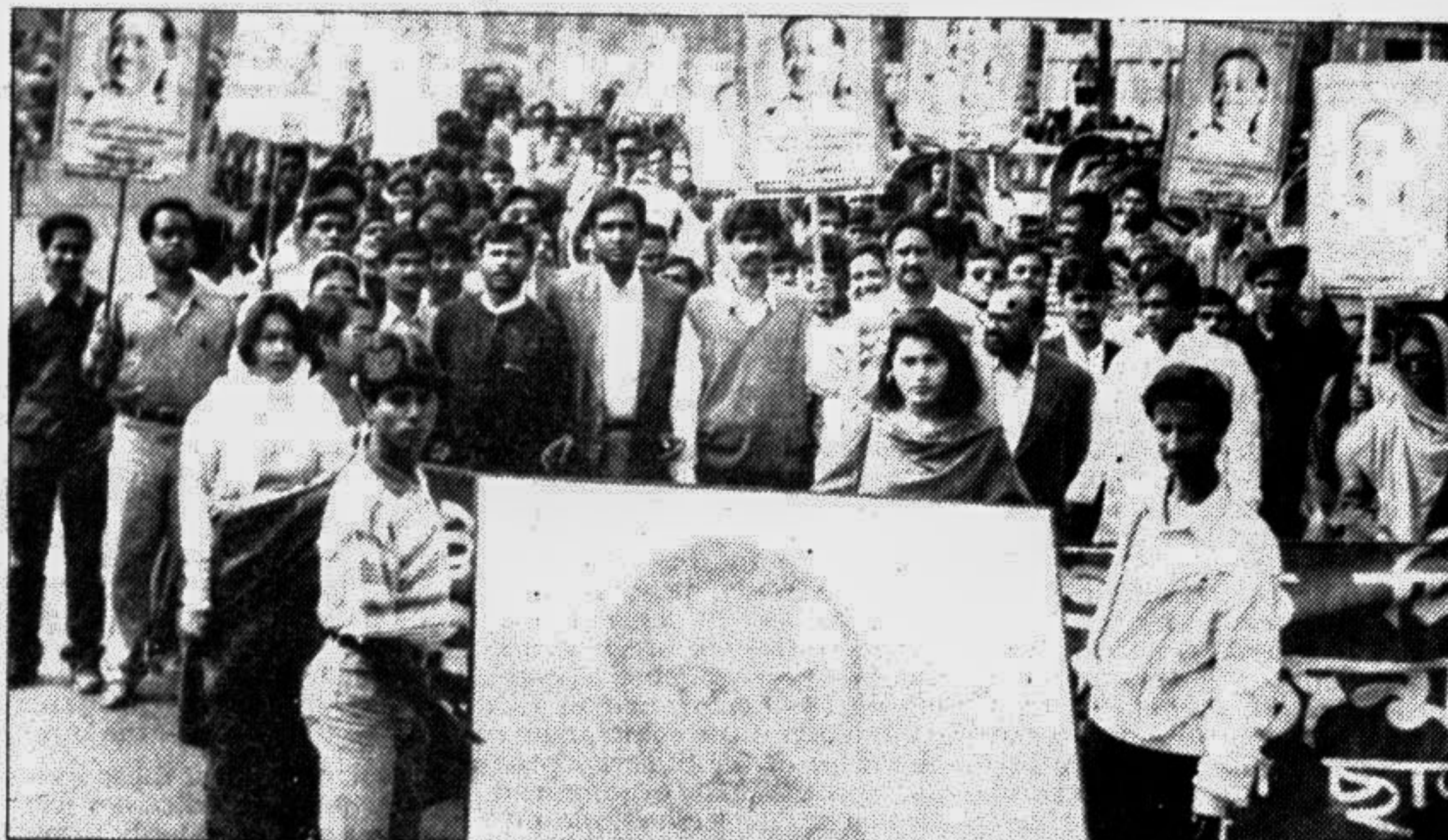
JCD rally in the city yesterday in observance of the 62nd birth anniversary of late president Ziaur Rahman.