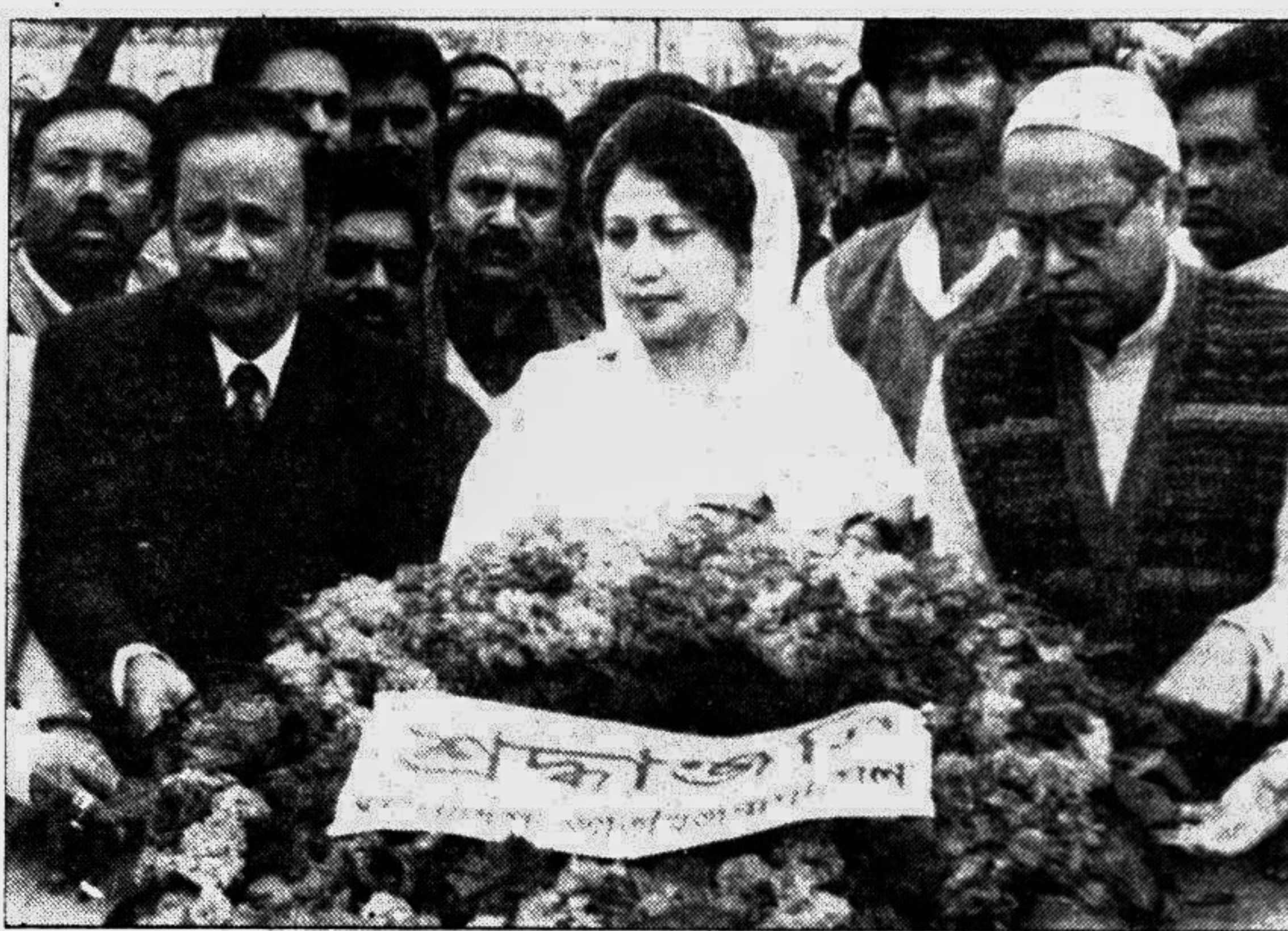
BNP Chairperson Begum Khaleda Zia along with other party leaders placing wreaths at the mazar of Shaheed President Ziaur Rahman in the city yesterday to mark his birth anniversary.