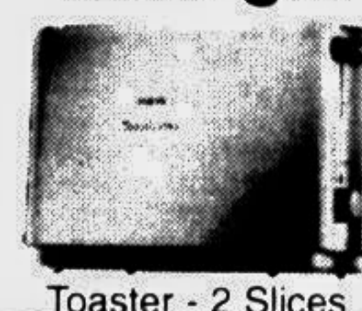
Toaster - 2 Slices