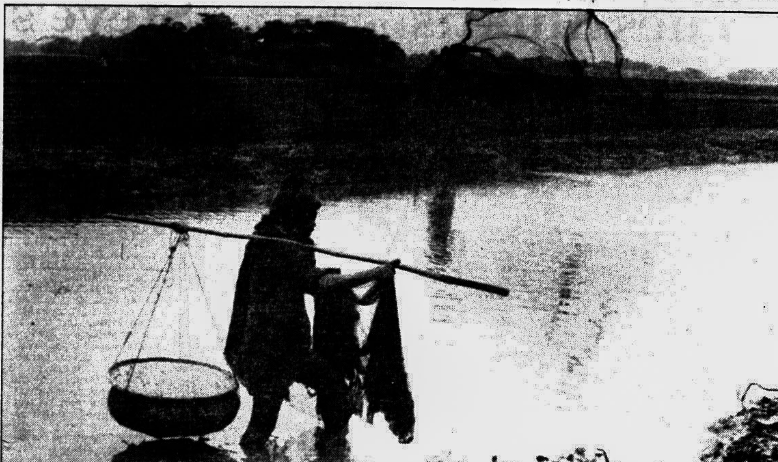
MUNSHIGANJ: Acute scarcity of fish has been prevailing in the district during this winter season. As a result, price of fish has shot up. This is because a small number of fishermen came out of their homes for fishing braving severe cold, while a large number of their fellow colleagues remained indoors sitting idle.

The districts are: Barisal, Jhalakati, Bhola, Pirojpur, Patuakhali, Barguna, Faridpur, Gopalganj, Madaripur, Rajbari and Shariatpur. According to an official source, the target of recovery was fixed at Tk 178 crore this year in this region. Of the total, Tk 5.92 crore was recovered from Barisal district, Tk 2.21 crore from Jhalakati, Tk 4.99 crore from Bhola, Tk 4.65 crore from Patuakhali, Tk 4.75 crore from Pirojpur, Tk 4.43 crore from Barguna, Tk 7.06 crore from Faridpur, Tk 4.59 crore from Madaripur, Tk 5.07 crore from Rajbari, Tk 4.92 crore from Gopalganj and Tk 5.07 crore from Shariatpur district.