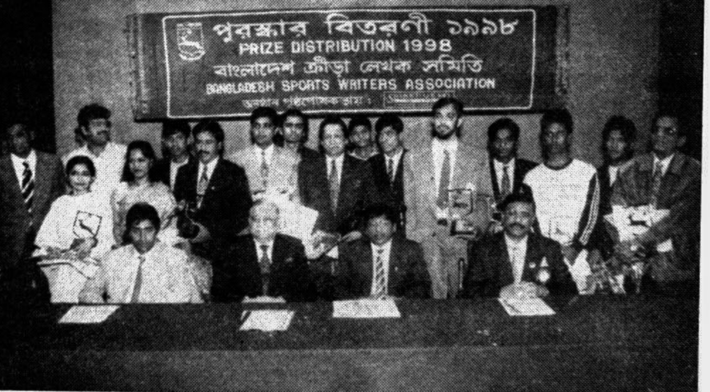
Winners of the Bangladesh Sports Writers' Association awards pose during the prize distribution ceremony at the National Museum yesterday.