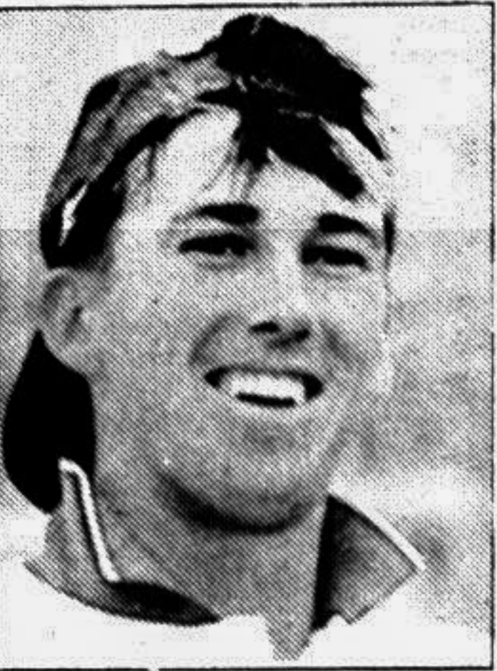
Glenn McGrath (Australia's No 1 pace bowler) "I'm at the stage, where I know my body as well as anyone else, and know whether I can get through a Test match."

COMPETITION FOR SCHOOL CHILDREN Competition-87