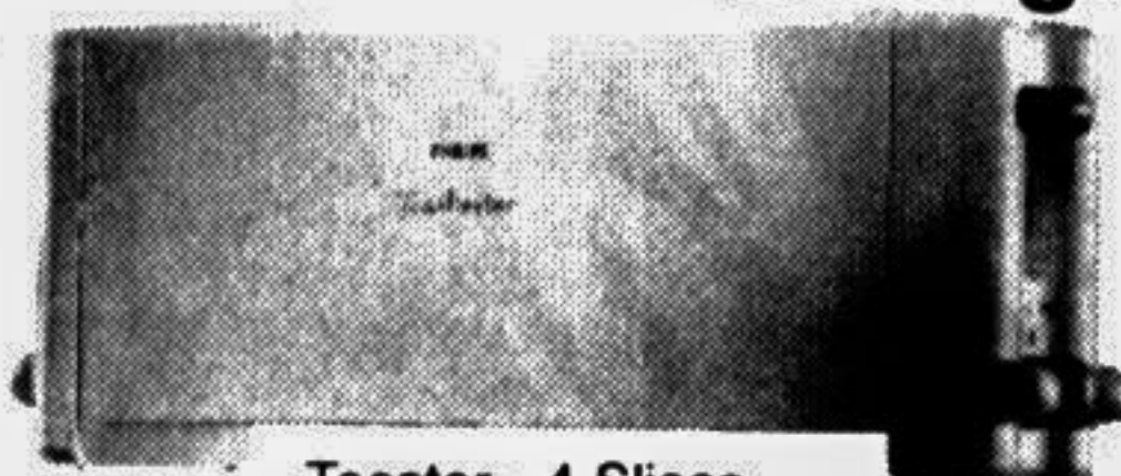
Toaster - 4 Slices