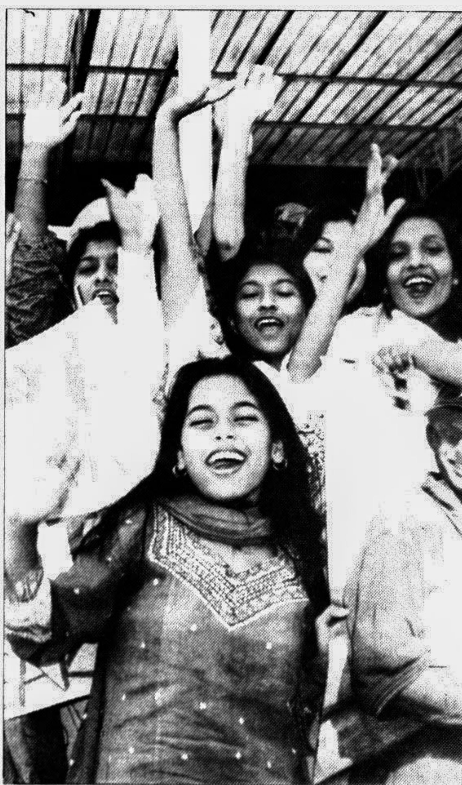
A section of female fans having a good time at the Dhaka Stadium yesterday.

AUCKLAND, New Zealand, Jan 16: Unseeded Australian Richard Fromberg upset second seed Felix Mantilla of Spain 6-3, 7-6 (10-8) Friday to reach the final of the BellSouth Open tennis tournament, reports AP. Fromberg will face Marcelo Rios of Chile in the final after the top seed overwhelmed Zimbabwe's Byron Black 6-1, 6-3 in just 54 minutes. Unlike his quarterfinal against Denmark's Kenneth Carlsen, when he swarmed all over the net, Rios made few advances up court on Friday. Rios broke Black in the first and third games to take the first set 6-1 in 21 minutes. Fromberg says Rios will be tough in the final.