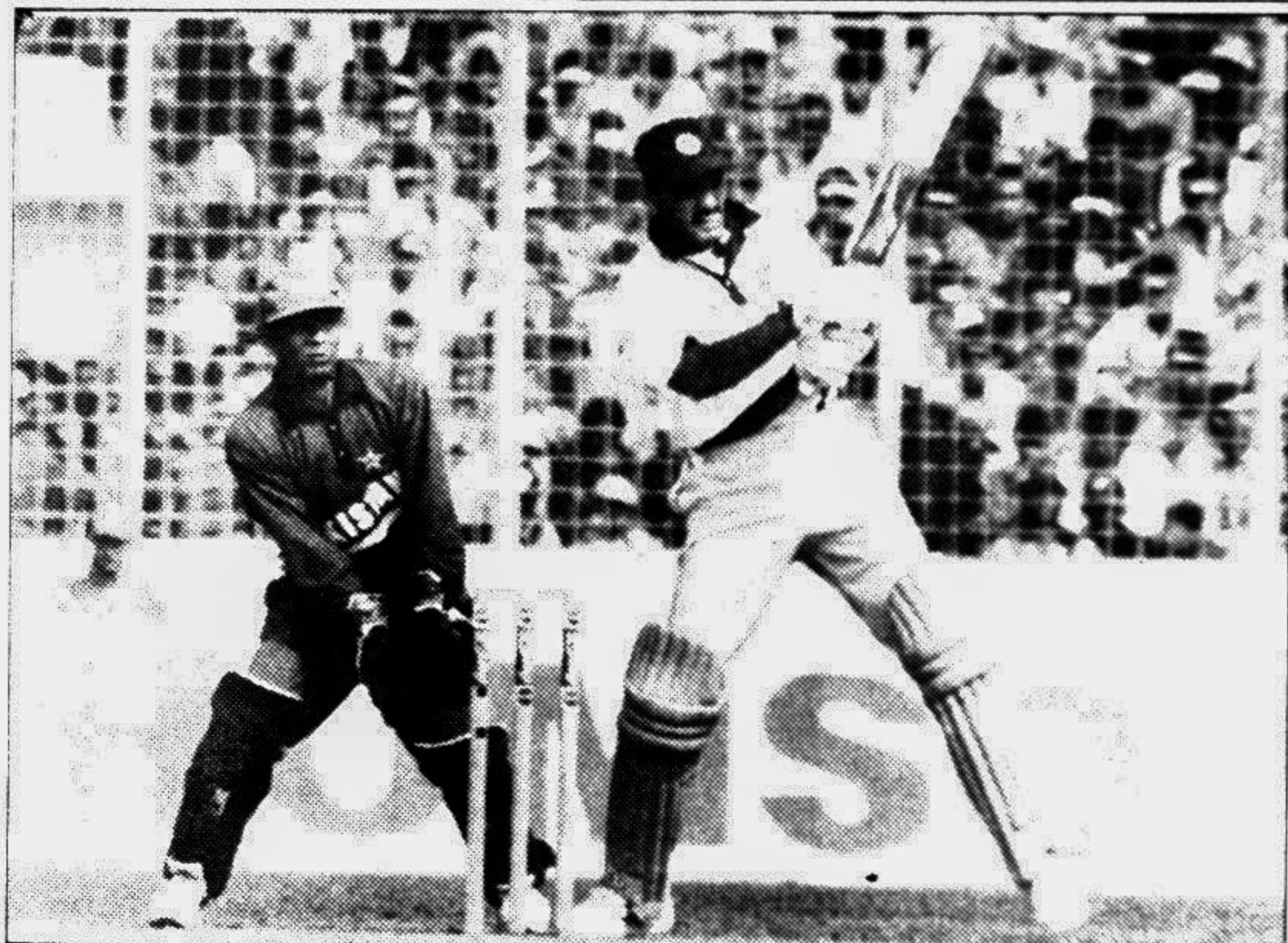
IT'S ALL IN THE WRISTS: Indian skipper Mohammad Azharuddin works the ball through mid-on using a typical wristy stroke while Pakistani counterpart Rashid Latif watches.

SCOREBOARD Scoreboard at stumps on the third day of the second and final Test between Zimbabwe and Sri Lanka at the Sinhalese Sports Club ground on Friday: ZIMBABWE: First Innings 251 SRI LANKA: First Innings 225 ZIMBABWE: Second Innings (overnight 24 for one) Rennie c Kaluwitharana b Aravinda 12 Flower b Jayasuriya 52 Whittall c Tillekeratne b Aravinda 2 Goodwin b Jayasuriya 39 Whittall c Jayawardena b Muralitharan 17 A Flower not out 61 Campbell c Kaluwitharana b Anurasiri 37 Wishart not out 14 Extra: (lb-5, w-1, nb-1) 7 Total: (for six wickets) 241 Fall of wickets: 1-22; 2-34; 3-104; 4-117; 5-129; 6-204 Bowling O M R W Pushpakumara 8 1 34 0 Aravinda 19 4 48 2 Muralitharan 34 7 70 1 Anurasiri 19 7 41 1 Jayasuriya 24 9 43 2