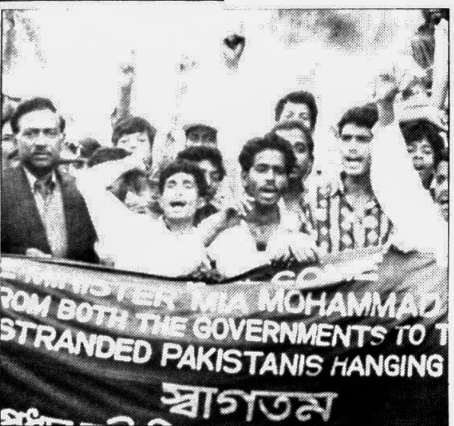
Stranded Pakistanis in Bangladesh staged demonstration in the city yesterday demanding immediate repatriation.