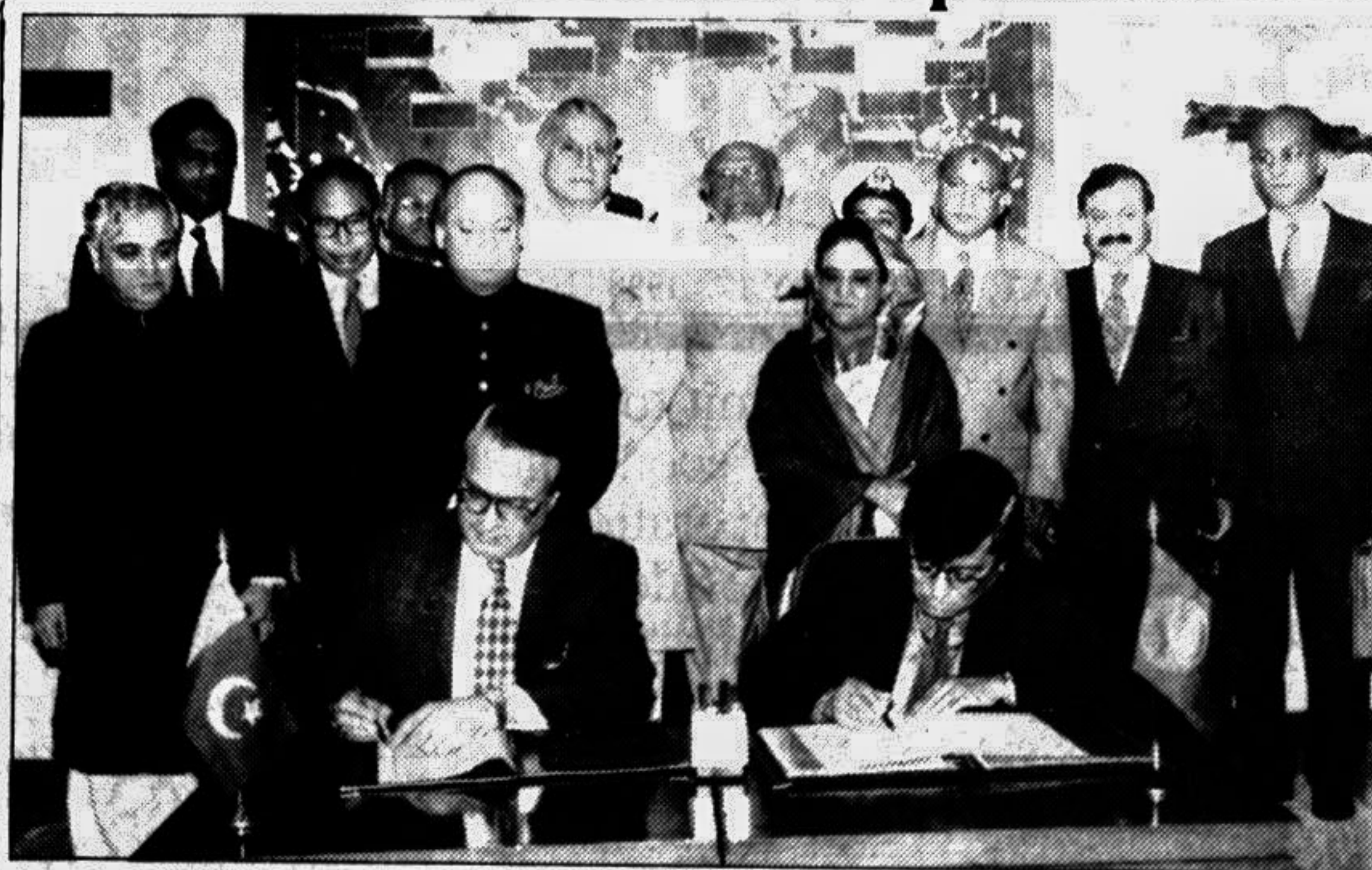
A cultural accord between Bangladesh and Pakistan was signed at the International Conference Centre in the city yesterday. Prime Minister Sheikh Hasina and her Pakistani counterpart Nawaz Sharif were present at the signing ceremony.