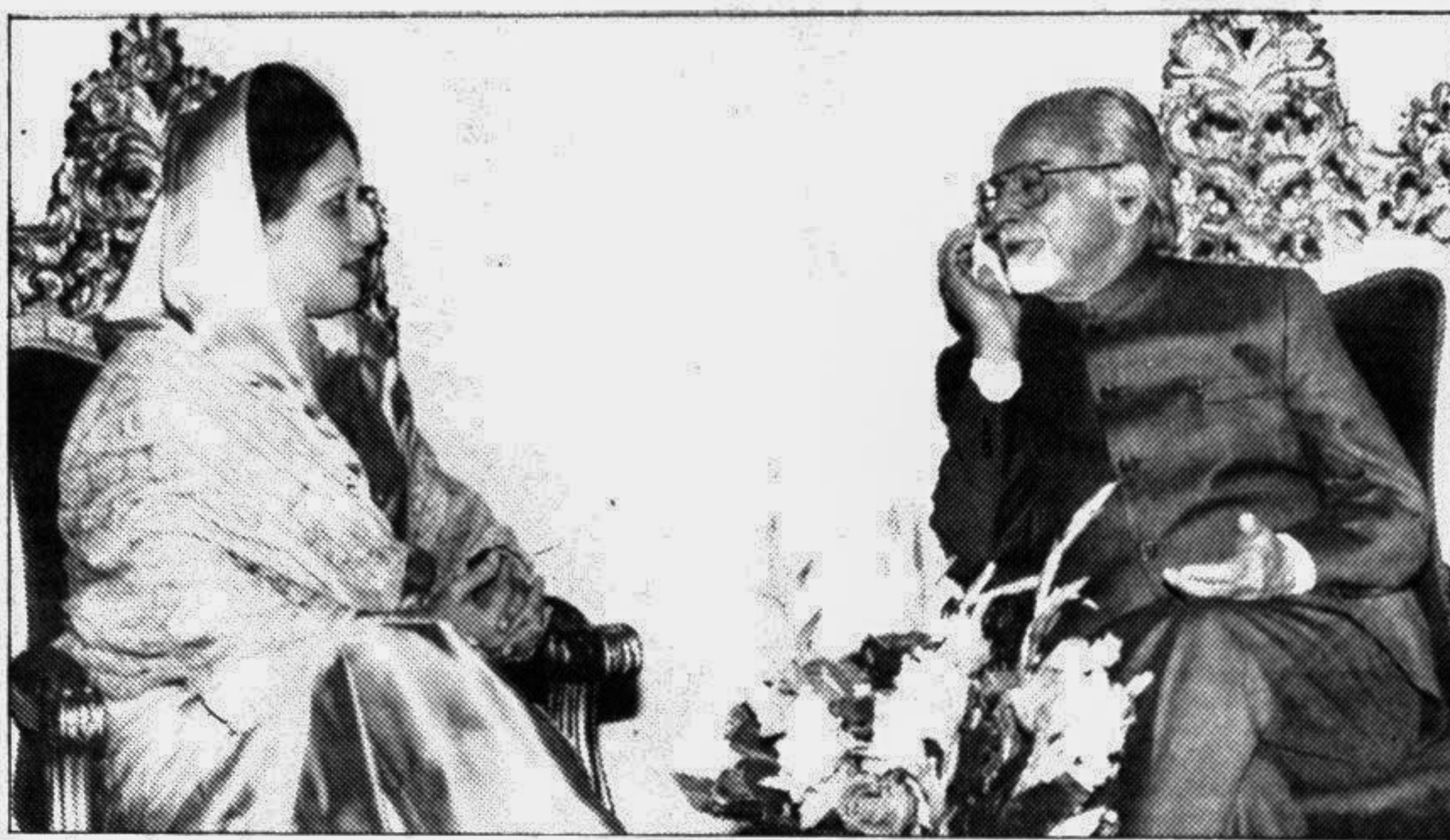
Leader of the Opposition in Jatiya Sangsad Begum Khaleda Zia called on Indian Prime Minister IK Gujral at his hotel suite in the city yesterday.

The two sides expressed their strong desire to bridge the gap between SAPTA and SAFTA.