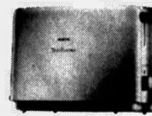
Toaster - 2 Slices

Transcom Electronics Limited Official licensee of Philips Electronics N.V. for lighting products, radio and TV sets