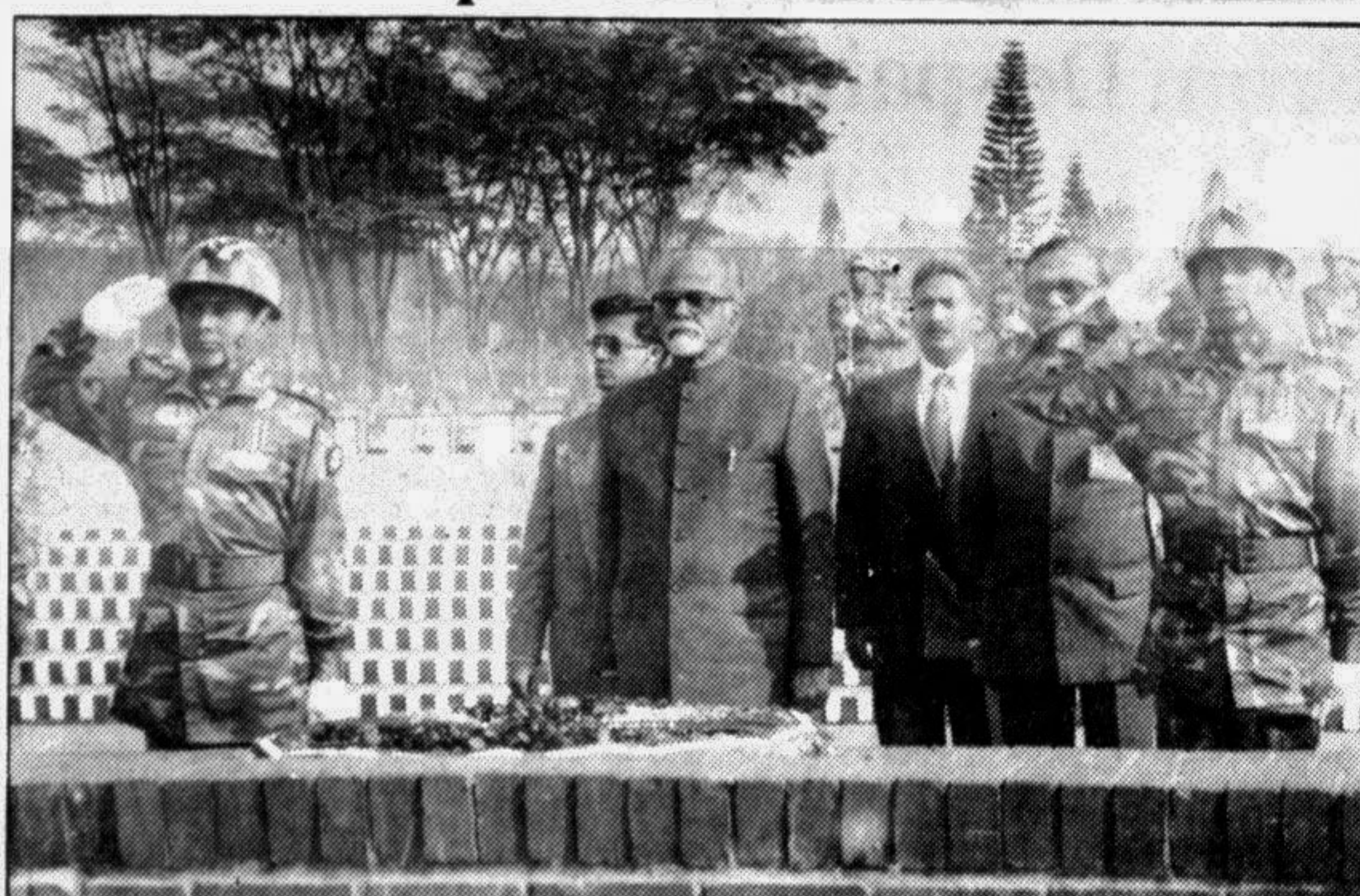
Indian Prime Minister I K Gujral laid wreaths at the National Mausoleum at Savar yesterday.