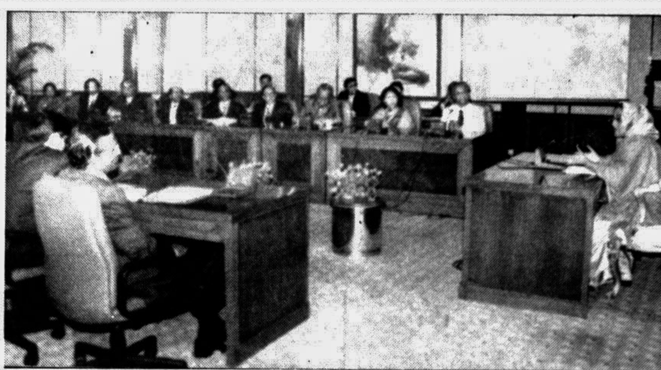
Prime Minister Sheikh Hasina addressing the officials of BCS (Administration) cadre who called on her at her office yesterday.

PAKISTAN: Rashid Latif (captain), Saeed Anwar, Shahid Afridi, Amir Sohail, Inzamam-ul-Haque, Ijaz Ahmed, Azhar Mahmood, Saqlain Mushtaq, Mushtaq Ahmed, Manzoor Akhter and Aaqib Javed.