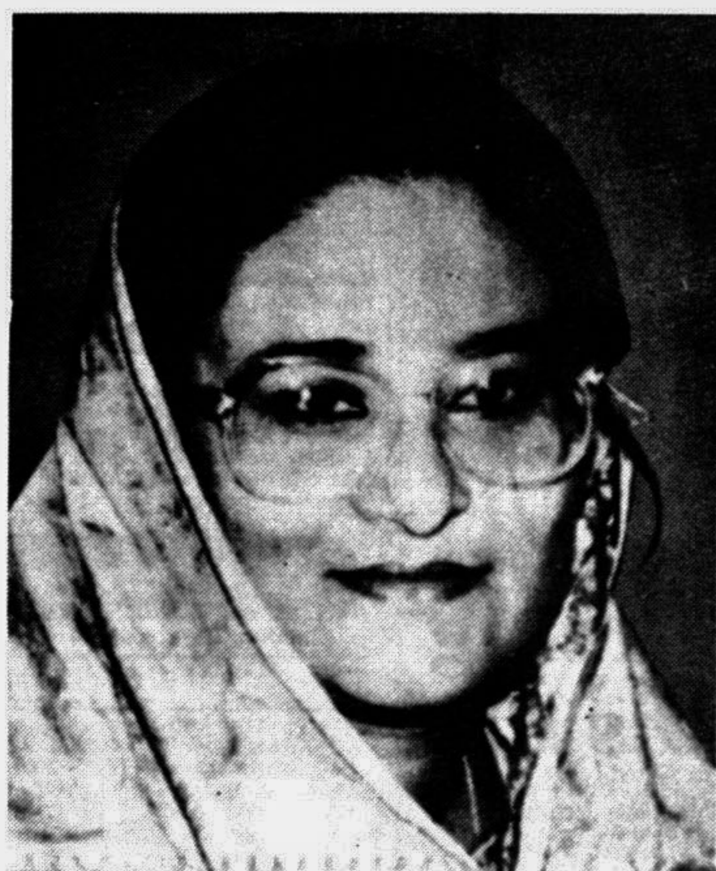
SHEIKH HASINA Honourable Prime Minister of Bangladesh

CII welcomes the meeting of the Prime Ministers of Bangladesh, India and Pakistan, and business delegations from these countries in Dhaka on 15th January, 1998