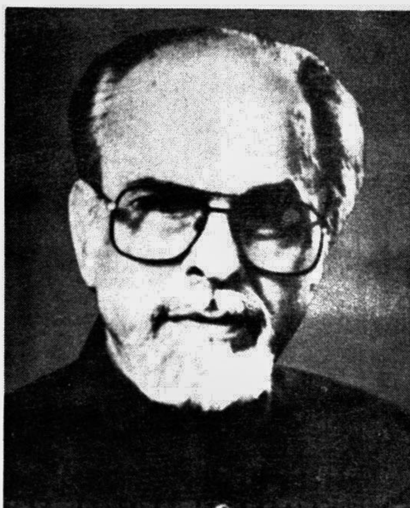
MR. INDER KUMAR GUJRAL Honourable Prime Minister of India