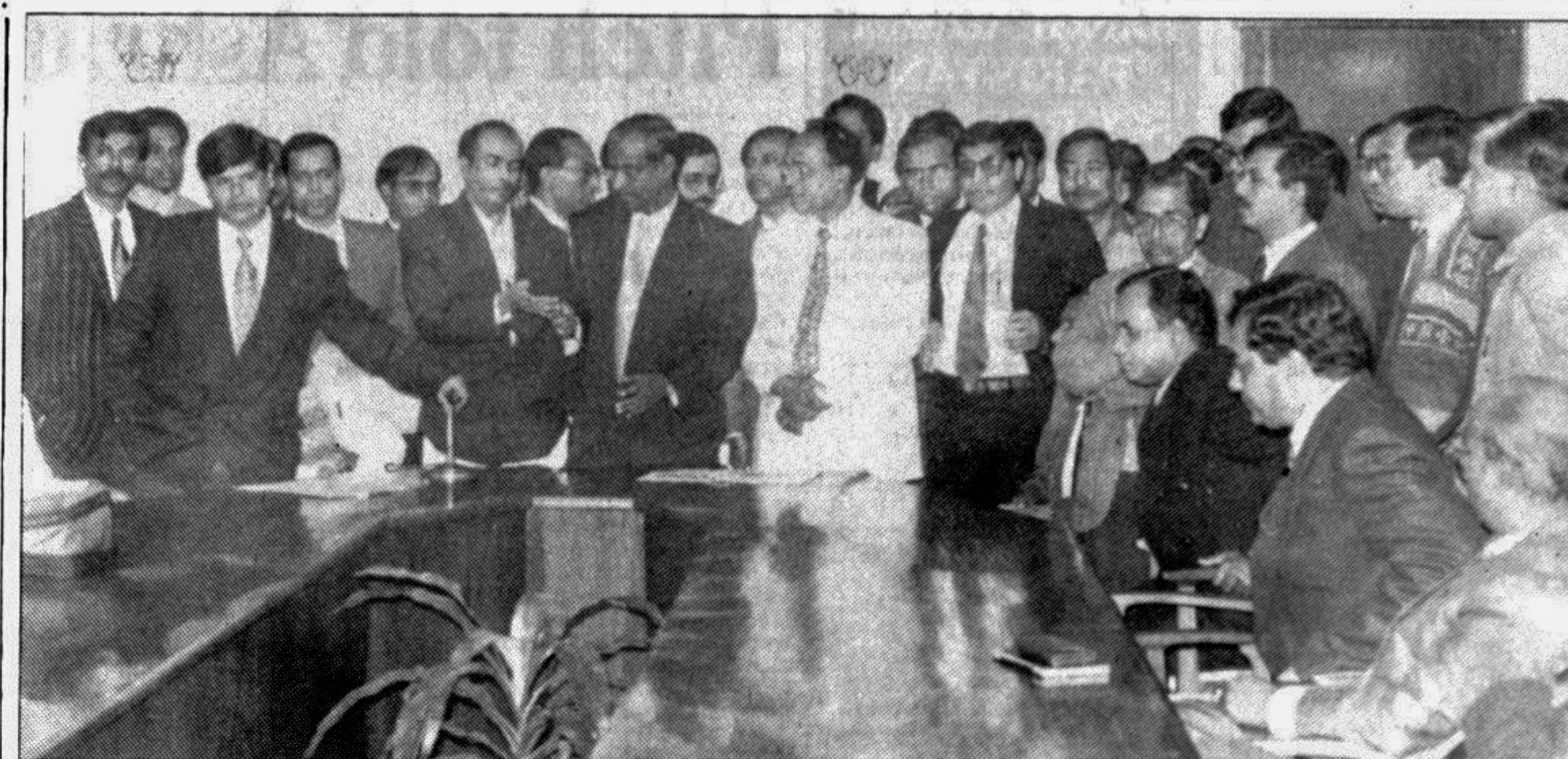
BCS (Administration) cadre officials held a meeting at the conference room of the Finance Ministry yesterday.

Published by the Editor from City Publishing House Ltd, 90 Kakrai, Dhaka-1000 on behalf of Mediaworld Ltd, 52 Motijheel C/A, Dhaka-1000. Editorial, News & Commercial Offices: House No: 11, Road No: 3, Dhanmandi R/A, Dhaka-1205. PABX: 500092-4, Commercial: 500091, Fax No: 88-02-863035, GPO Box No: 3257, Cable: DAILYSTAR, DHAKA. Internet edition address: http://www.dailystarnews.com and Email address: dstar@bangla.net