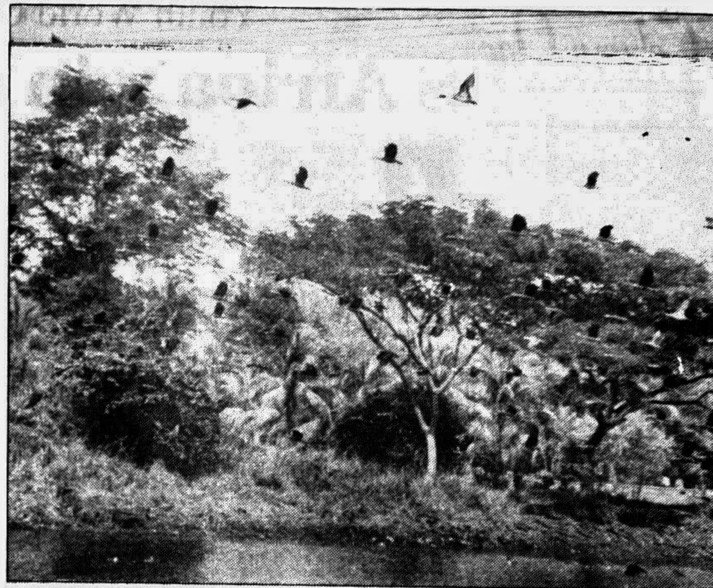
Local and migratory winter birds have appeared in large numbers in Nizhum Deep this winter. Are these birds breaking silence on this island?

Of the total foodgrains 513 metric tons were distributed among 2,849 destitute families in Agajhara thana, 459 metric tons among 2,549 families in Gourmadi, 43.2 metric tons each among 240 families in Hizla, Babugonj and Banaripara, 93.3 metric tons among 520 families in Mehendigonj, 50.4 metric tons among 280 families in Muli, 270 metric tons among 1,500 families in Bakergonj, 54 metric tons among 300 families in Barisal sadar and 609 metric tons among 3,381 families in Wazirpur thanas, the source said.