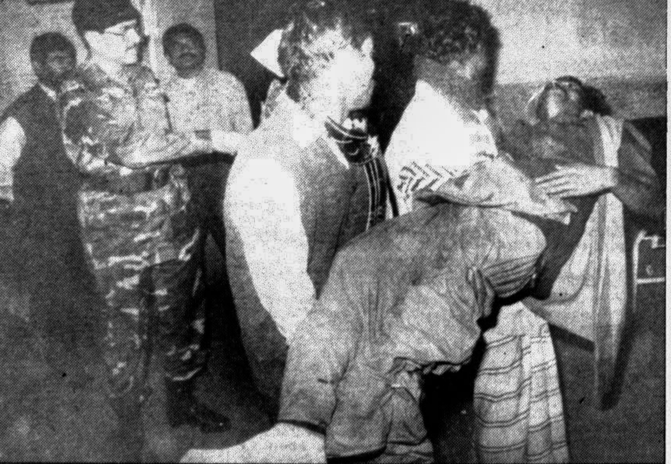
A critically injured patient at the emergency wing of DMCH.

During a visit to the country's busiest and biggest hospital on Tuesday last, this correspondent found that both the emergency medical officers (EMO) were being entertained by a representative from a reputed drug manufacturing company while patients waited outside.