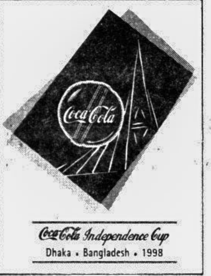
Coca-Cola Independence Cup Dhaka - Bangladesh - 1998

When asked whether his team will play or not against Pakistan if the weather remains same, Azhar said, "Well we will have to discuss the matter with the match referee. Let's hope we have a 9 am start tomorrow."