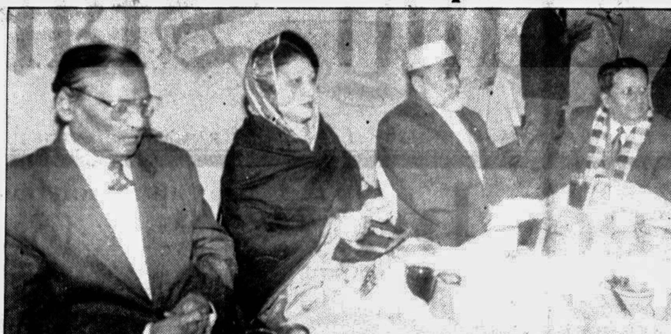
Leader of the Opposition in Parliament and BNP Chairperson Khaleda Zia hosted an iftar party for professionals at her official Minto Road residence yesterday.