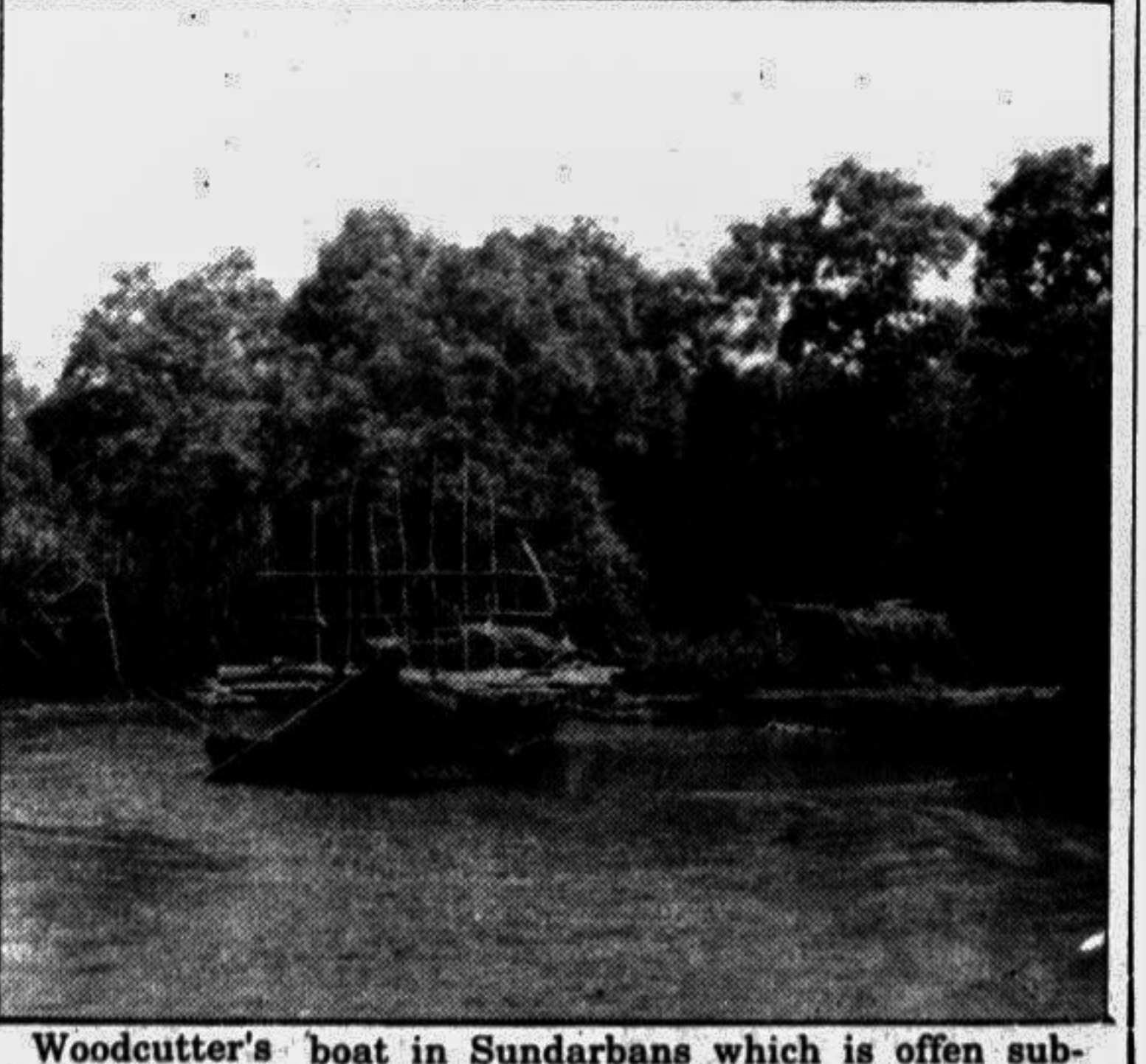
Woodcutter's boat in Sundarbans which is often subjected to robbery.