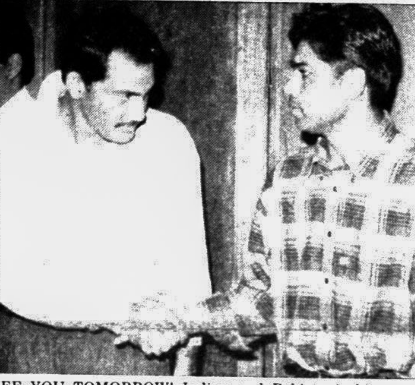
SEE YOU TOMORROW! Indian and Pakistani skippers Azharuddin (L) and Rashid Latif shake hands at a function at the Sonargaon Hotel yesterday.

Sports Reporter Arch rivals and former world champions Pakistan and India will meet today the second day of the Independence Cup Cricket tournament. Weather permits, the match will kick-off at Dhaka Stadium at 9 in the morning. India earned two points yesterday beating Bangladesh by four wickets in the opener. Hosts Bangladesh will play their second and last first round match against Pakistan on January 12. The top two teams of the first round will qualify for the three-match finals to be held on See Page 12 Col 3