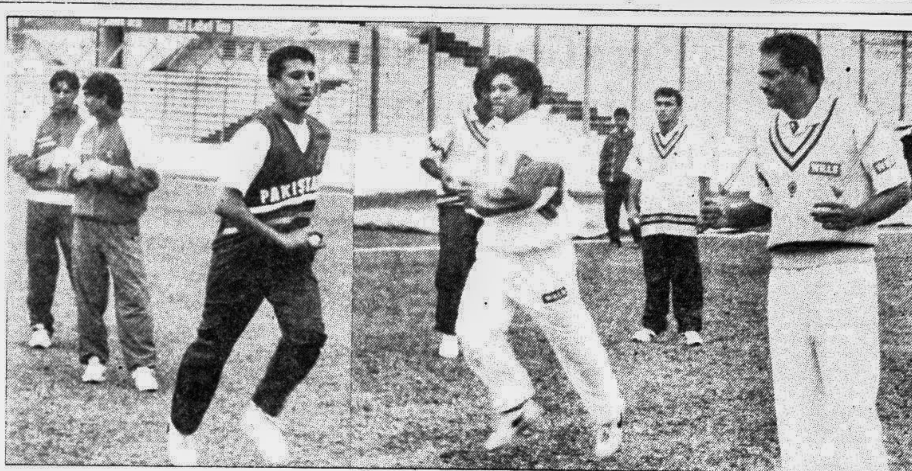
The Pakistani (L) and Indian teams practising at the Dhaka Stadium yesterday.