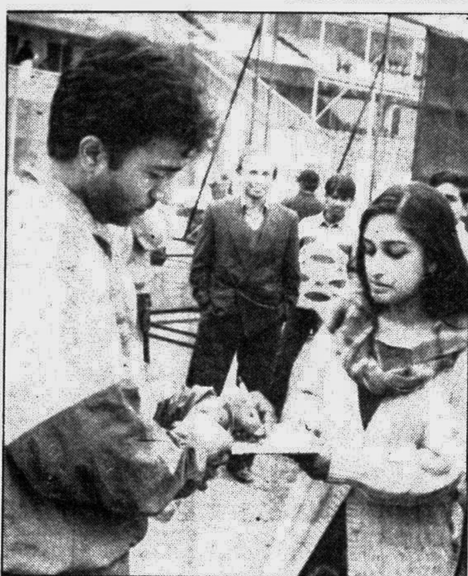
Pakistan master batsman Saeed Anwar gives his autograph to an admirer at Dhaka Stadium yesterday.

In 1996 there were 28 French athletes who tested positive for nandrolone.