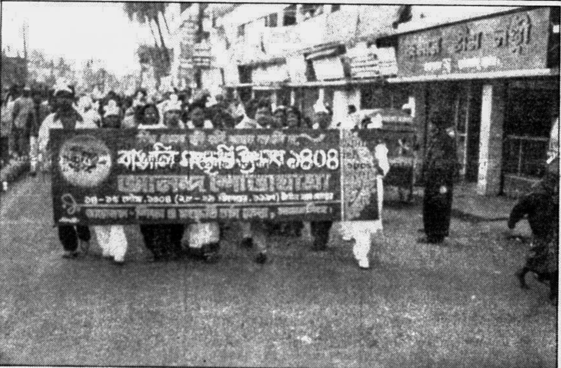
MYMENSINGH: A colourful procession was brought out on December 25 in the town in observance of Bengali cultural festival organised by the local educational and cultural centre.

Meanwhile, Thana Nirbahi Officers (TNOs) were withdrawn and two others transferred, show cause notice were served against 8 returning officers, 6 presiding officers were temporarily suspended and were sent to the jail hajat. Besides, four officers in-charge of 4 thanas were closed.