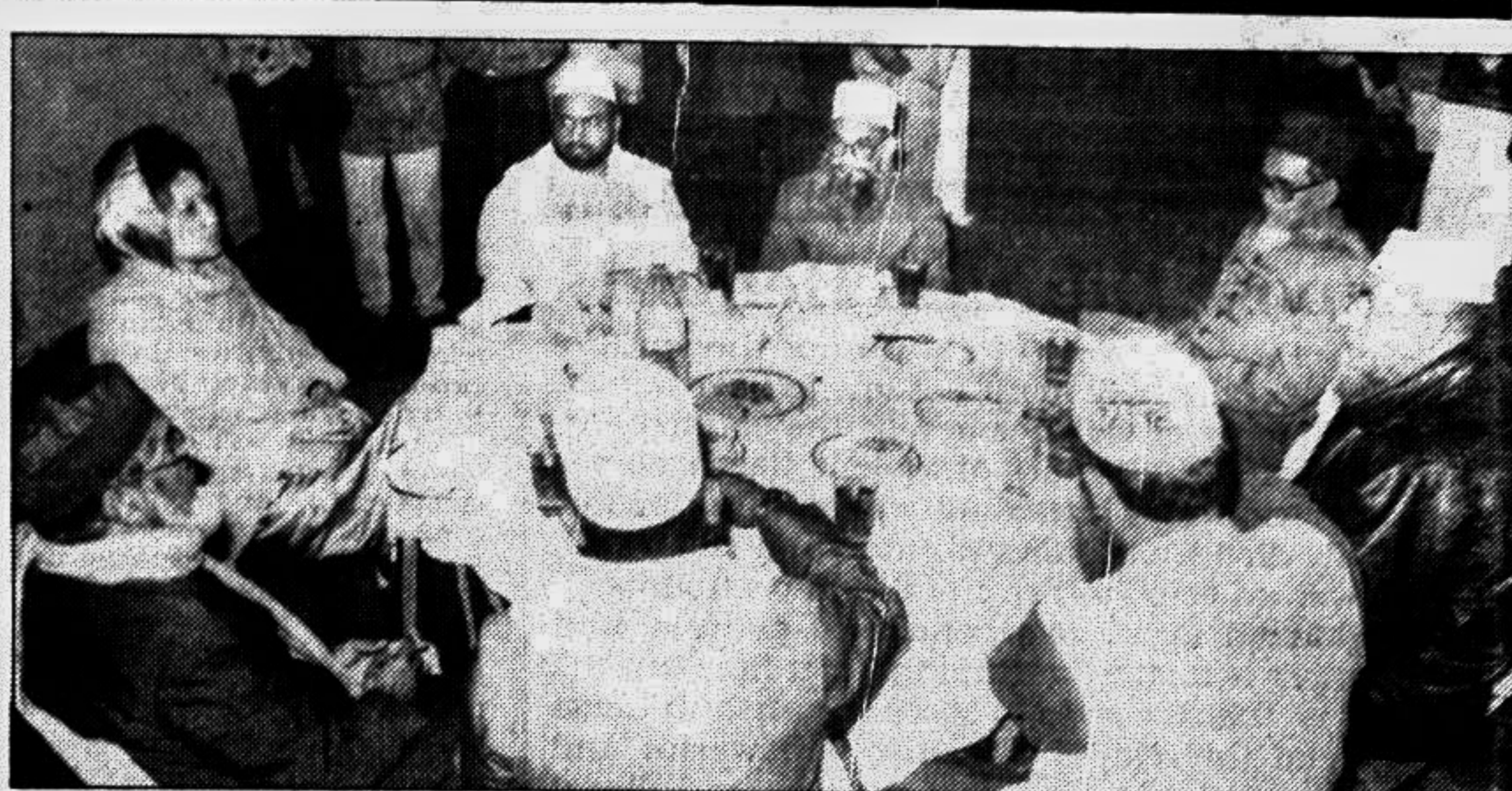
Leader of the Opposition in Parliament and BNP Chairperson Khaleda Zia hosted an Iftar party for ulemas at her official residence in Minto Road yesterday.

Meanwhile, LORD and Cooperatives Minister and general secretary of Awami League has urged all the branch offices of the party to observe the homecoming of Bangabandhu in a befitting manner.