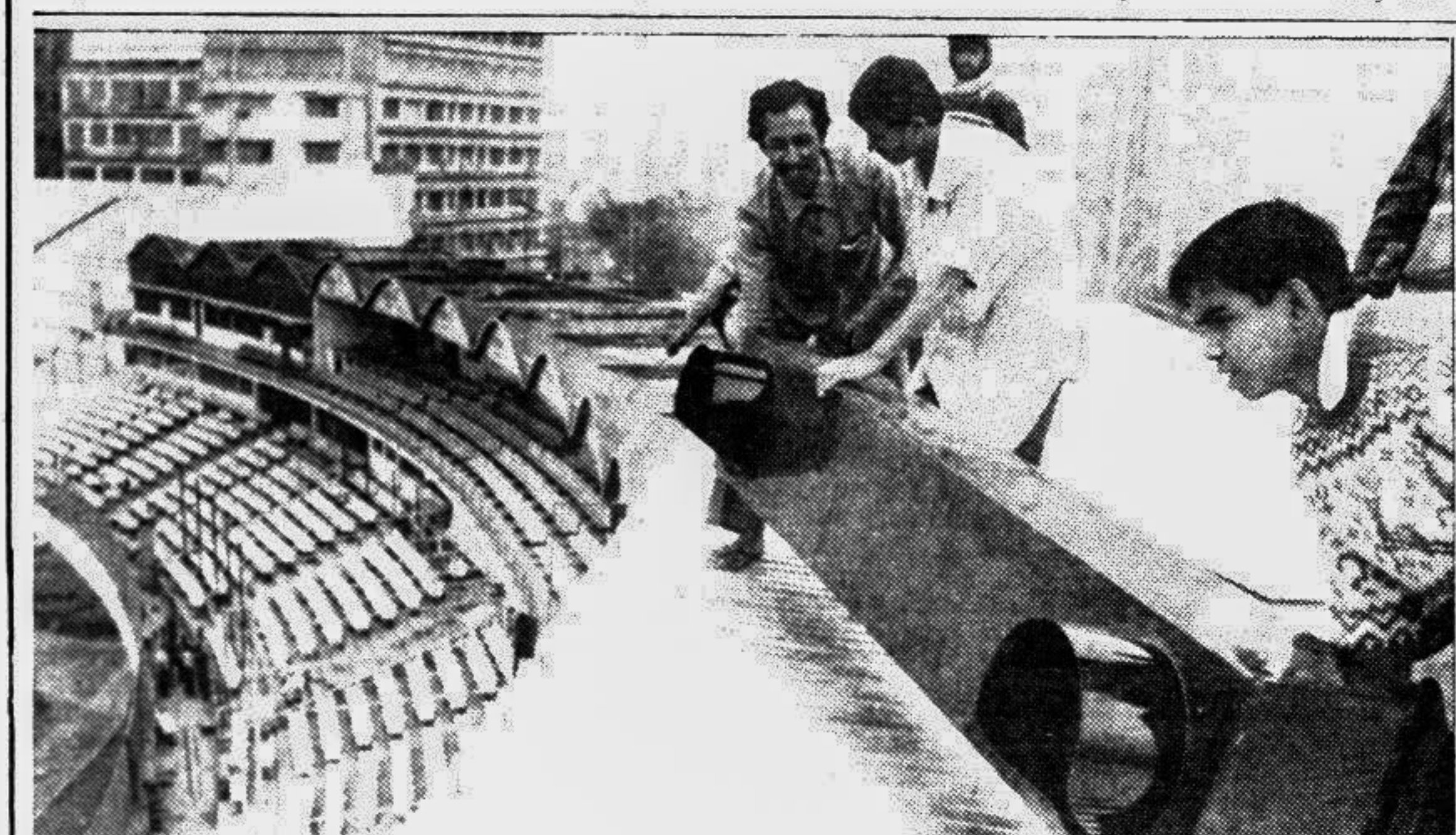
DHAKA BECOMES HI-TECH: Lights for the third umpire's verdict are being positioned on the rooftop of the pavilion at Dhaka Stadium yesterday. The stadium will host the Coca-Cola Independence Cup Tri-nation Cricket Tournament from January 10 (Details on Page 11).

'Efforts will be made to bring the Federation leaders to a dialogue with the officials of the ministry,' said a high official of one of the boards after See Page 12 Col 3