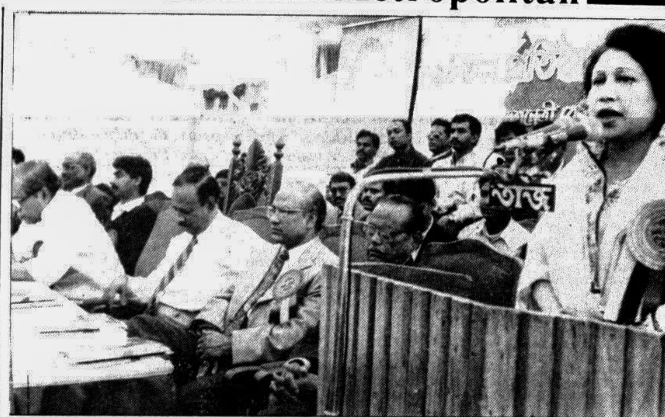
BNP Chairperson and Leader of the Opposition Khaleda Zia inaugurated a function marking the 19th founding anniversary of Jatiyatabadi Chhatra Dal at Diploma Engineers' Institution yesterday.

For Information Contact: Admissions Office, NSU Main Campus, 10:00AM to 2:00PM, Sunday - Thursday