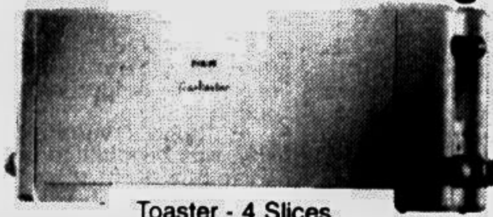
Toaster - 4 Slices

Transcom Electronics Limited Official licensee of Philips Electronics NV for lighting products, radio and TV sets