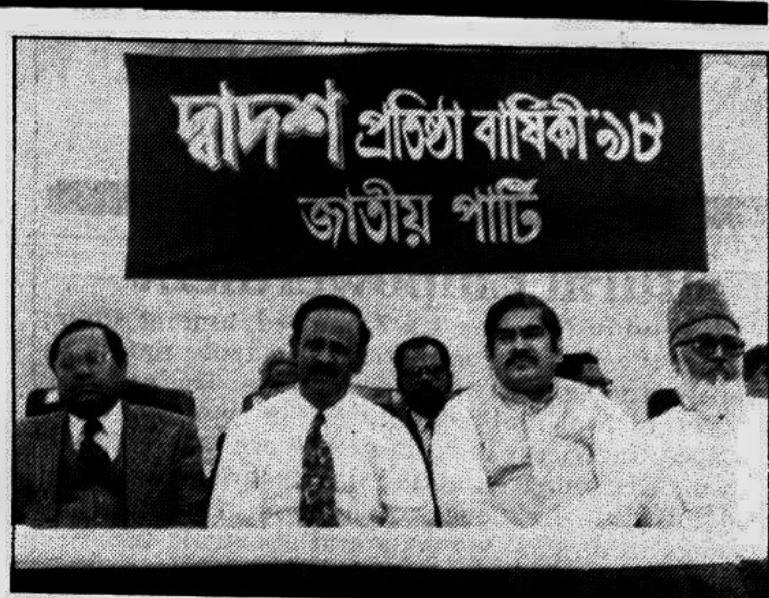
Jatiya Party (Zafar-Moazzem) held a discussion meeting yesterday at the Institute of Diploma Engineers' Institute premises marking the 12th founding anniversary of the party.