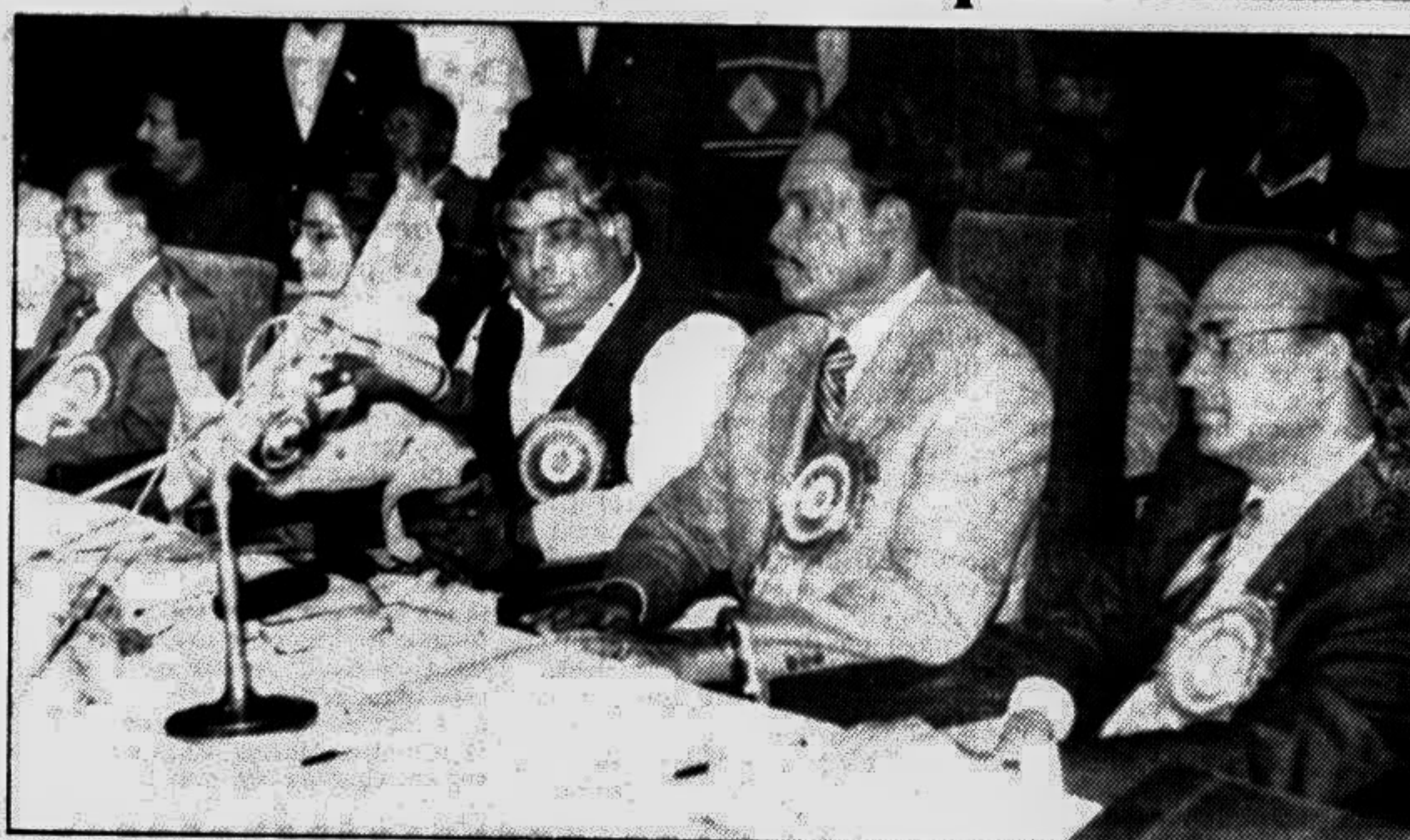
Jatiya Party Chairman Hussain Muhammad Ershad and other leaders at the discussion meeting marking the 12th founding anniversary of the party at the auditorium of Engineers' Institute yesterday.