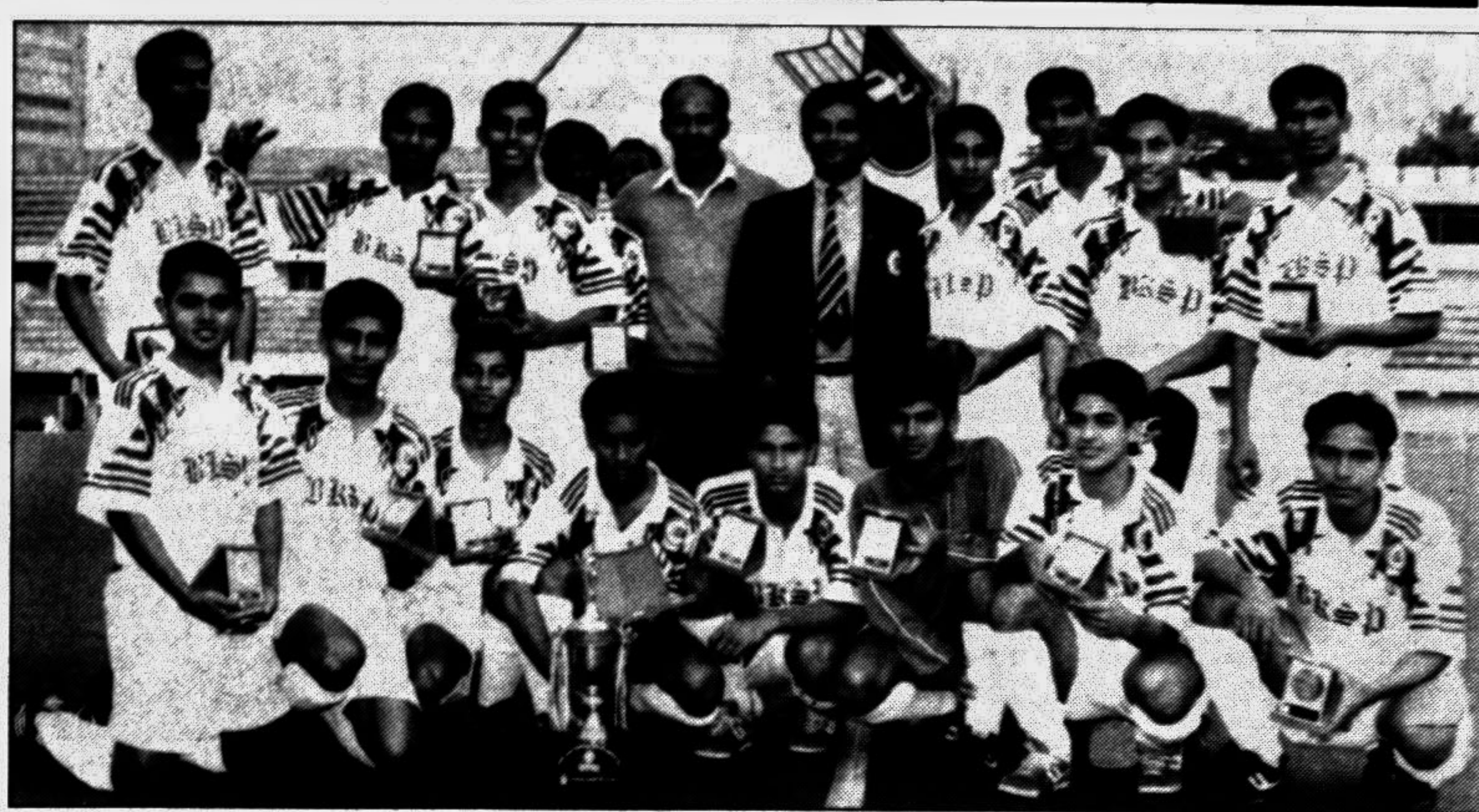
Players and officials of the victorious BKSP team who clinched the national youth hockey championship title.