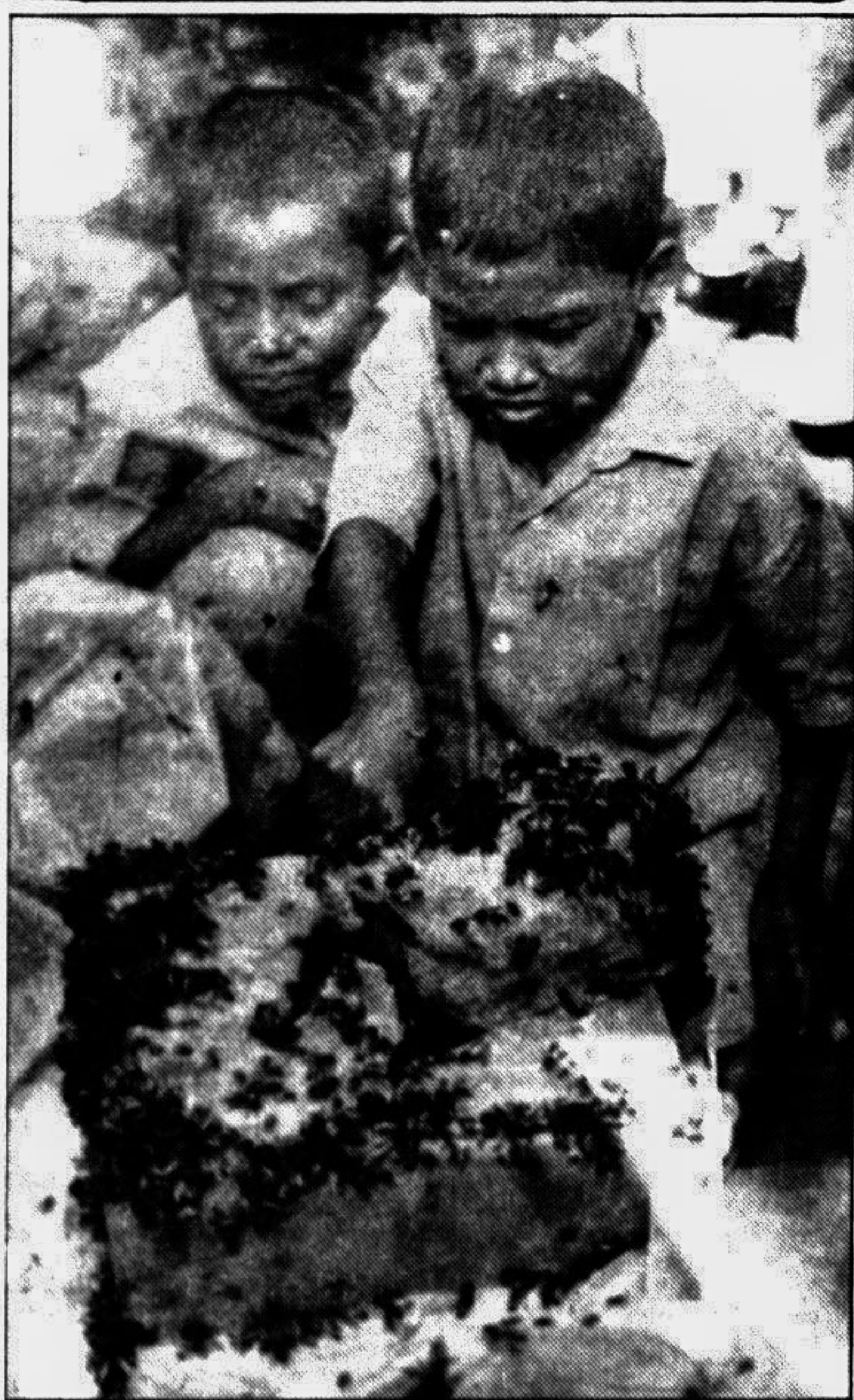
MUNSHIGANJ: Two rural boys trying in vain to catch bees from hard molasses from a village market in the district.