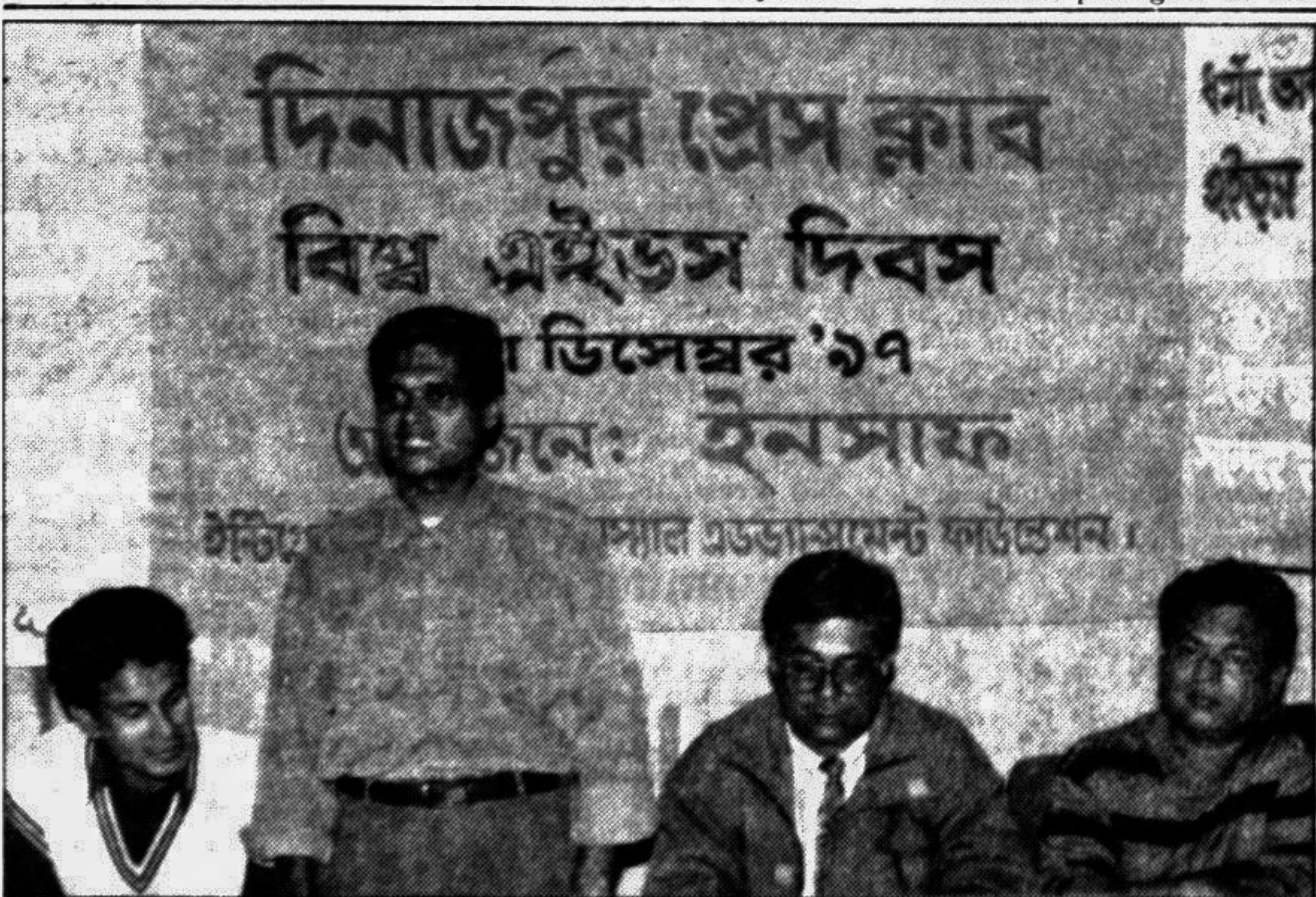
DINAJPUR: A discussion meeting was arranged recently in Dinajpur Press Club here by Integrated Social Advancement Foundation in observance of World AIDS Day.

When contacted Kaliganj thana police said, a case was recorded with them and none was arrested in that connection.