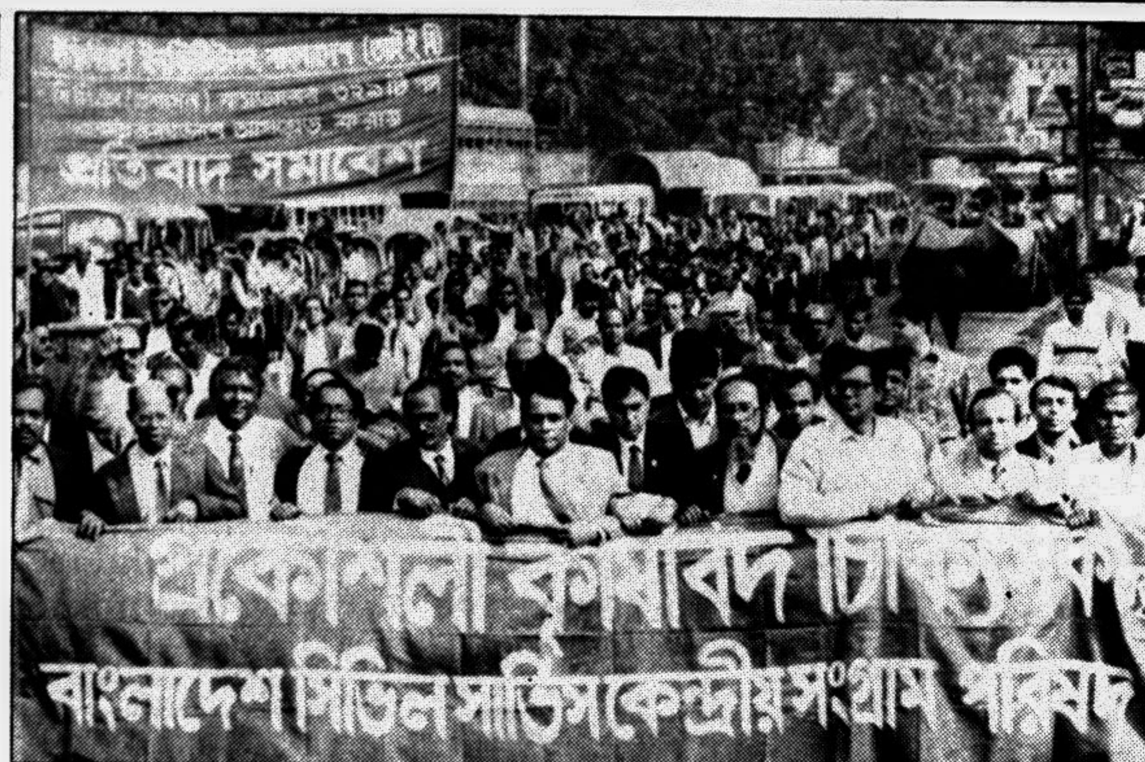
Prokrichi brought out a procession in the city yesterday protesting the upgradation of 329 posts in the BCS Administration Cadre.

March 23: BNP called dawn- See Page 12 Col 8