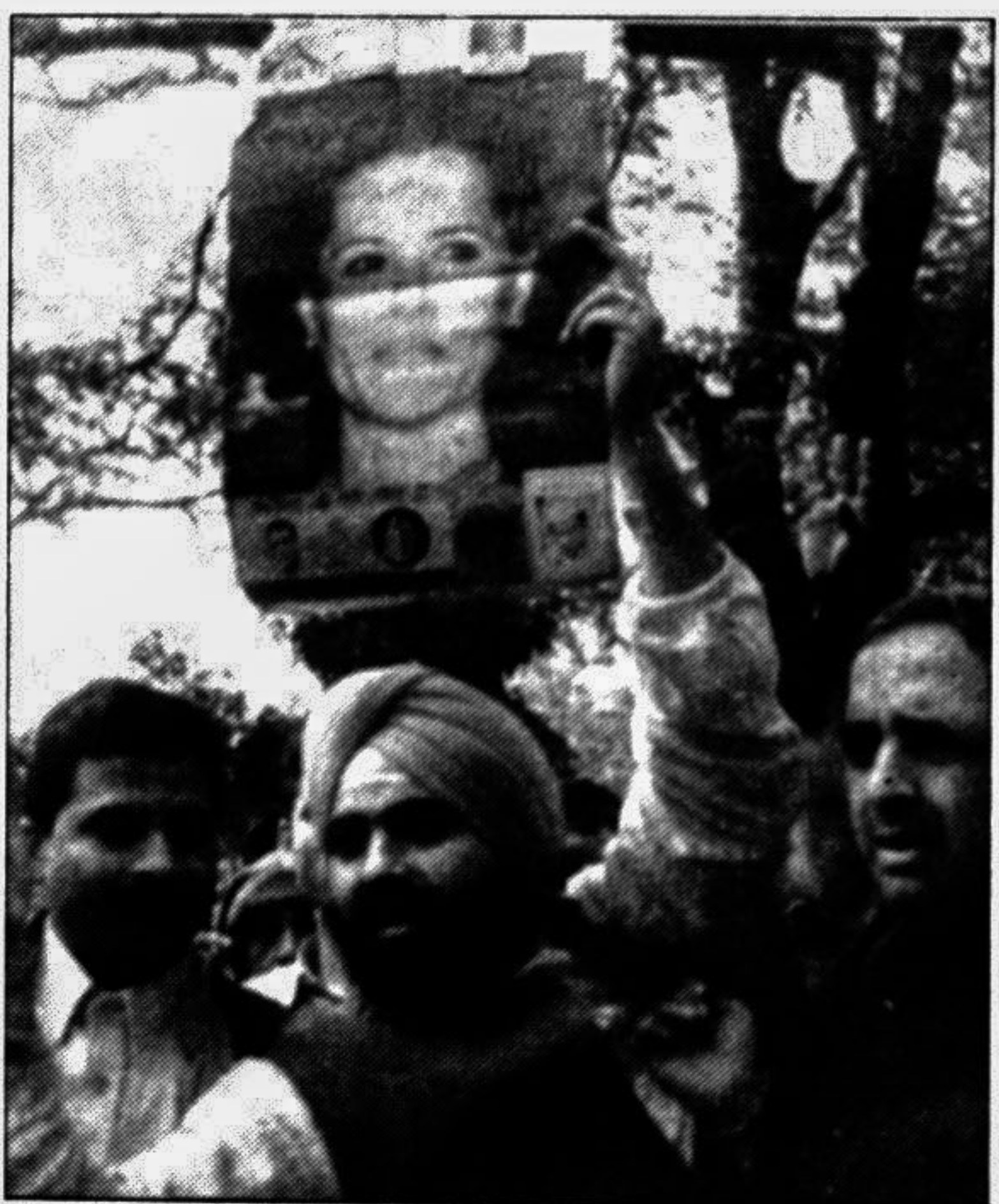
A Sikh supporter holding a poster of Sonia Gandhi during a rally outside her residence in New Delhi yesterday.