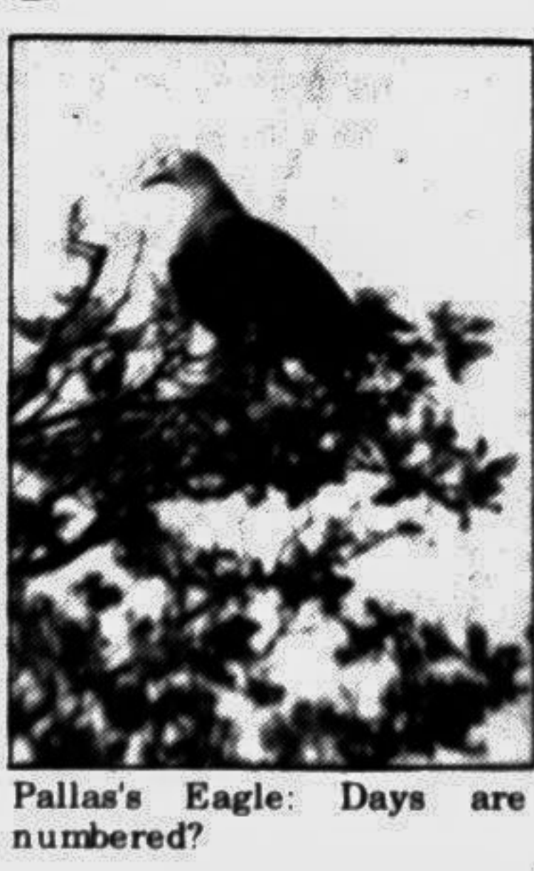
Pallas's Eagle: Days are numbered?

during its breeding season, ornithologists visiting the area said. There are about 80 Eagles, adults and sub-adults, living in the area. The Pallas's Eagle, known locally as Kura, is listed as rare in the world red book of endangered species, compiled by the International Union of Nature (IUCN). They retreated to the Rangchi Bag, skirting the huge wetland of Tangar Haor, when they found their nests dwindling in other parts of that region and elsewhere in the country. When The Daily Star carried a story on the fate of the Eagle on November 25, the government decided to investigate. An urgent message was faxed See Page 12 Col 8