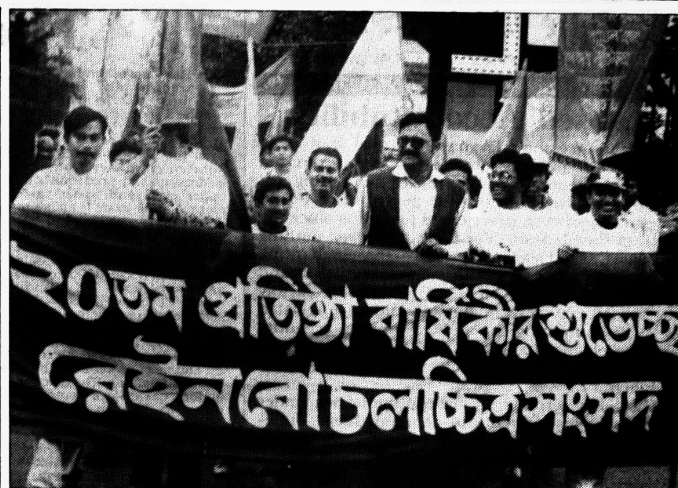
Rainbow Film Society held a rally in the city to mark its 20th founding anniversary yesterday.