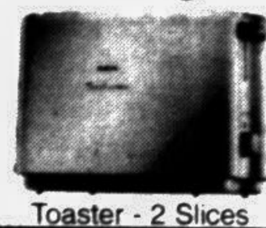
Toaster - 2 Slices