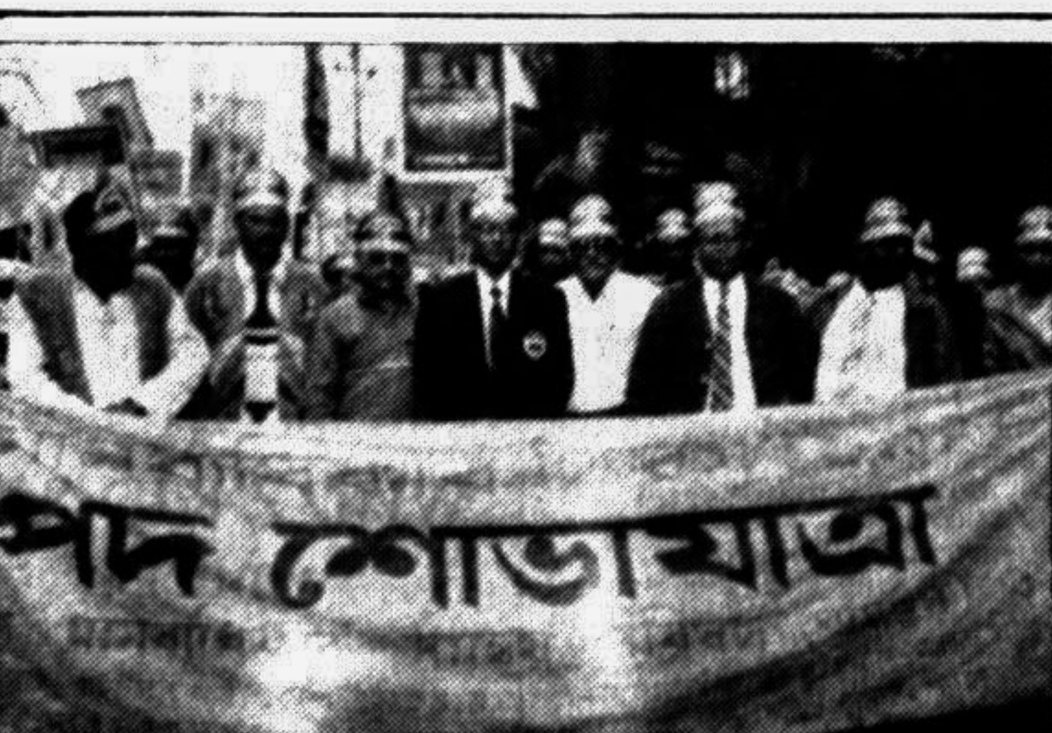
JESSORE: A colourful rally was brought out in the town recently on the occasion of World Human Rights Day.