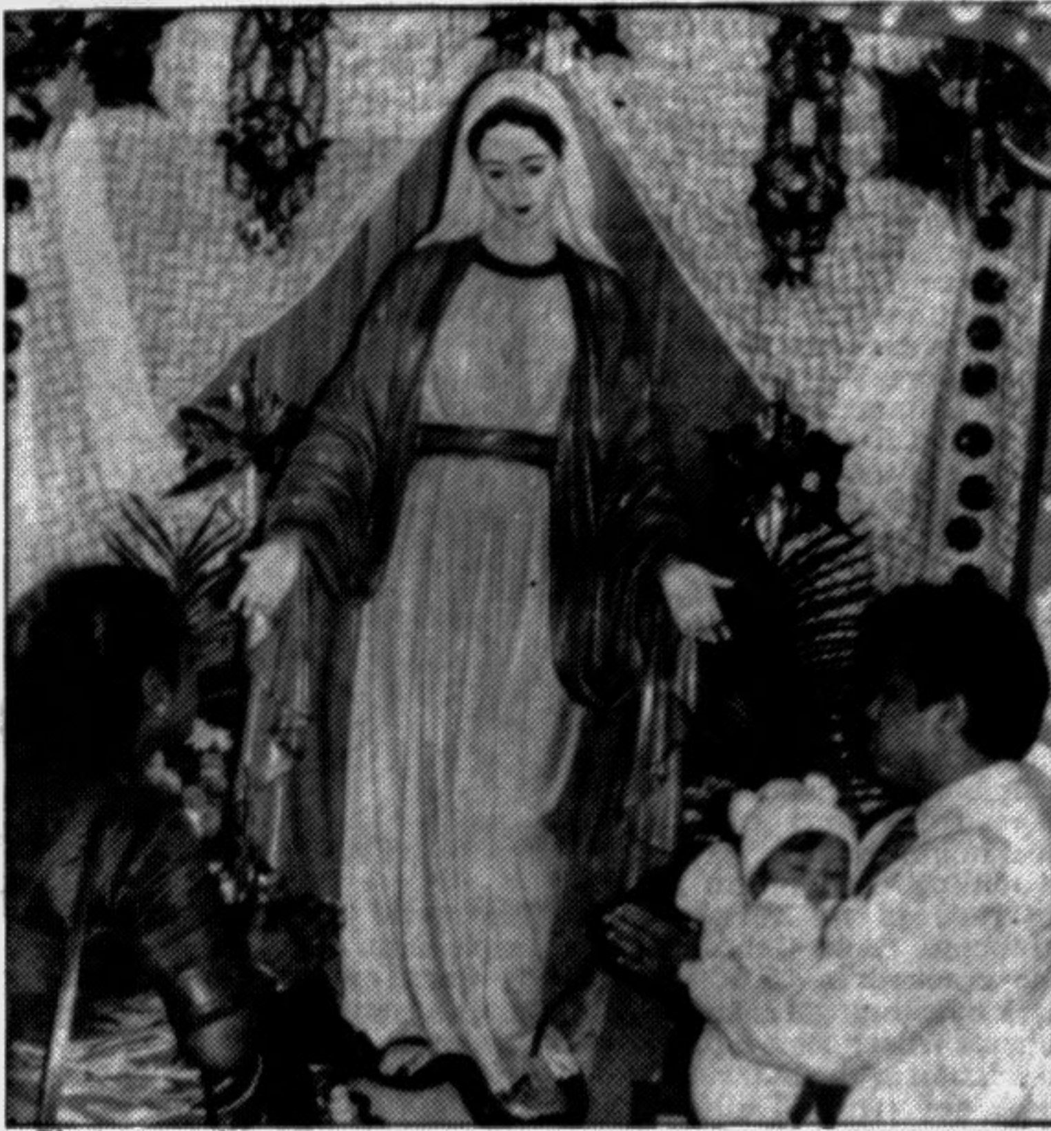
Christian devotees praying at the Kakrail Church in the city on the Christmas Day yesterday.