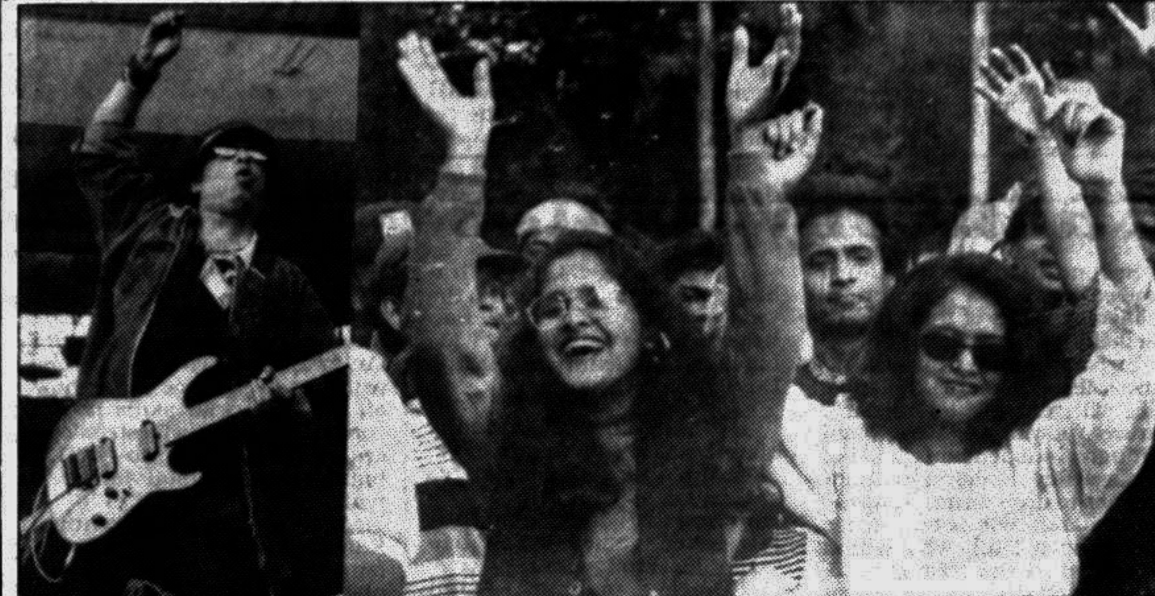
(Left) A performer at a BAMBACoca Cola concert at the Shaheen College ground in the city yesterday. (Right) A partial view of the jubilant audience.

Hossain acknowledged existence of some recruiting agencies either with forged licences or without licences and said operation of these agency agencies need to be stopped. He also assured of BAIRA's cooperation in this respect.