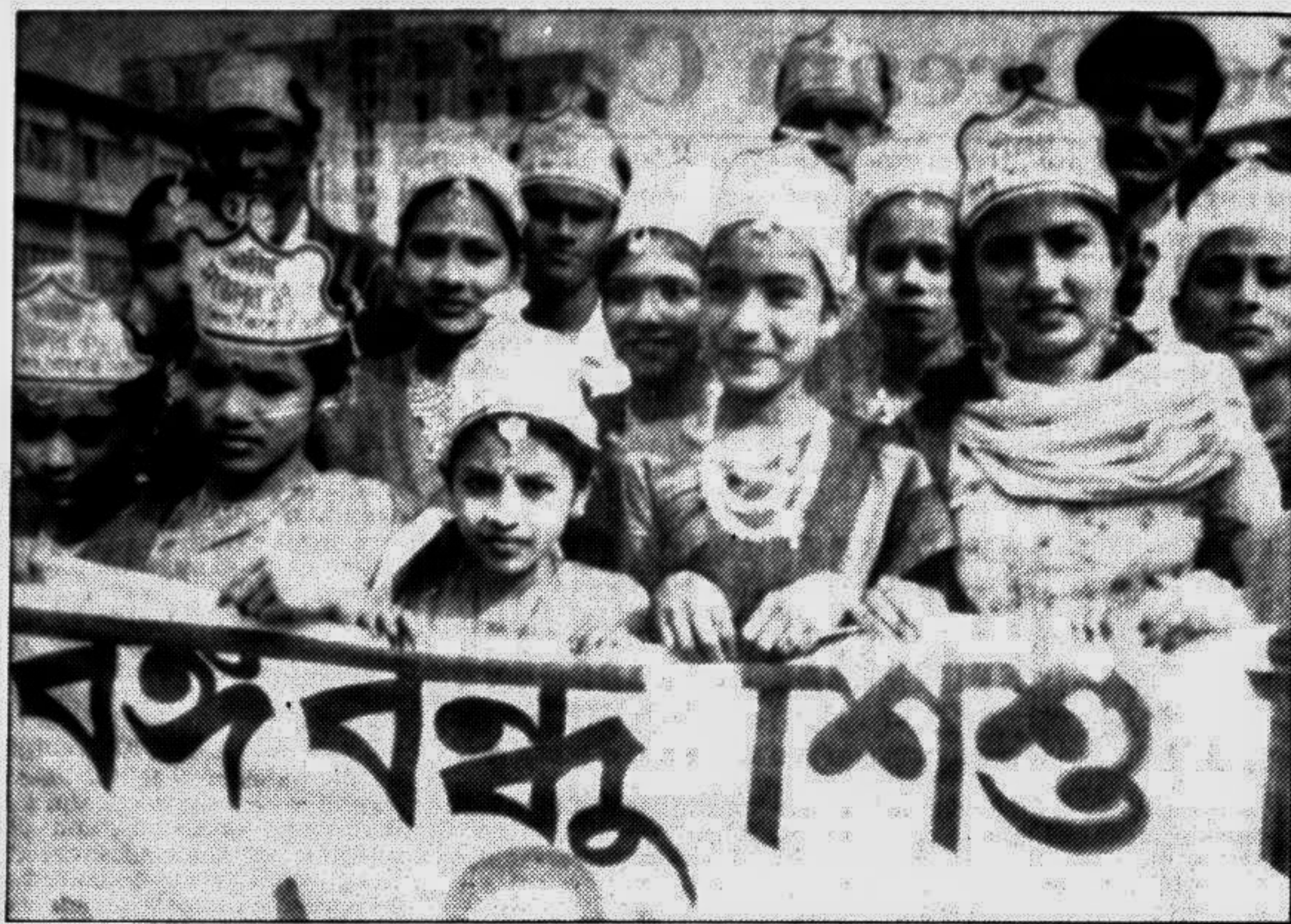
Bangabandhu Shishu Kishore Mela staged a rally on the occasion of its national conference '97 in the city yesterday.

The Annual General Meeting (AGM) of the Overseas Correspondents Association, Bangladesh (OCAB) and election of its Executive Committee for the year 1998 will be held at the National Press Club tomorrow at 11 am. All OCAB members have been requested to attend the meeting on time.