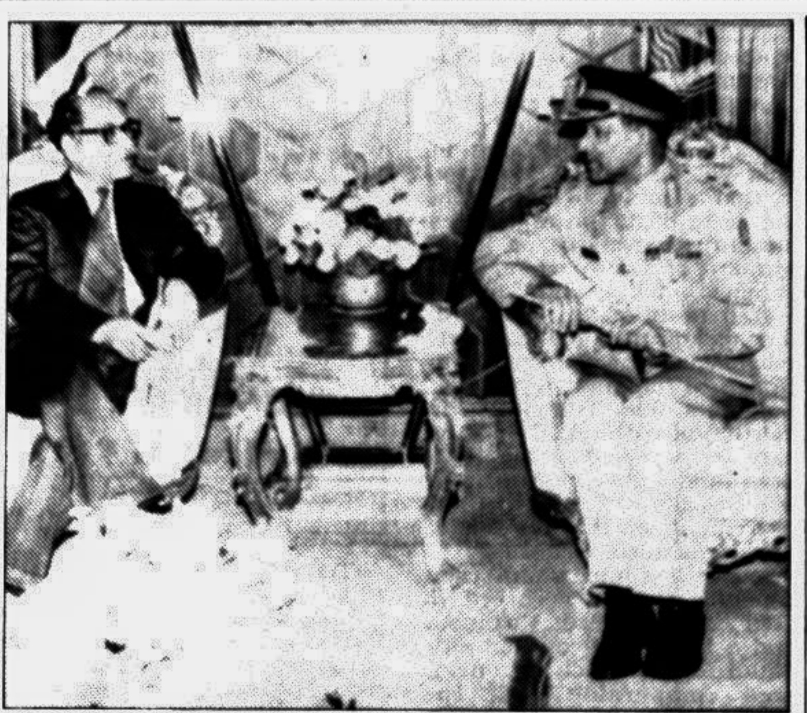
Newly-appointed Army Chief Lt Gen Mustafizur Rahman called on President Shahabuddin Ahmed at the Bangabhaban yesterday.