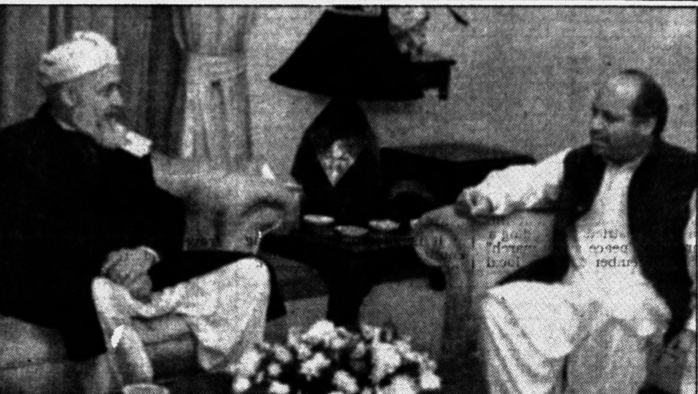
Ousted Afghan President Burhanuddin Rabbani, (L) meets with Pakistan Prime Minister Nawaz Sharif in Prime Minister House, Islamabad, Tuesday. Rabbani was flown from Mazar-e-Sharif, in northern Afghanistan, to Islamabad on Sharif's official aircraft. Rabbani said war is not the solution and called for negotiated end to the bloodletting that is ripping his homeland apart.

China has been waging a campaign against Tibet's exiled spiritual leader, the Dalai Lama, whom Beijing accuses of seeking independence for the