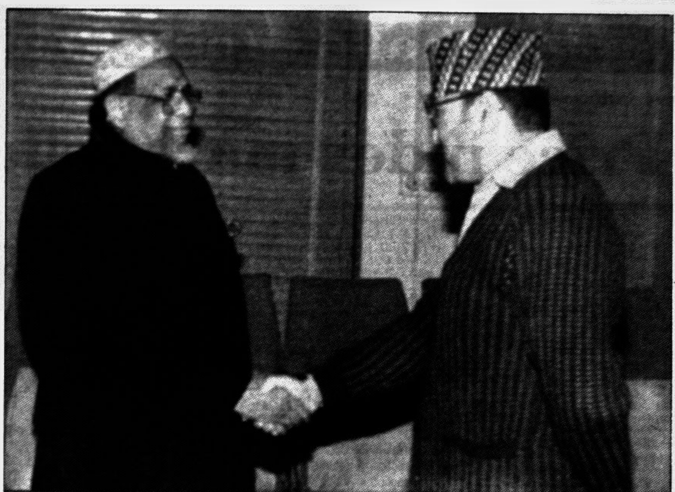
Bangladeshi Foreign Minister Abdus Samad Azad (L) called on Nepalese King Birendra at the Royal Palace in Kathmandu Tuesday.

BELGRADE, Dec 24: Hardliners called an inaugural session of the Bosnian Serb Republic's newly elected parliament on the December 27 deadline set by international mediators, the Bosnian Serb news agency SRNA said on Tuesday, reports Reuter.