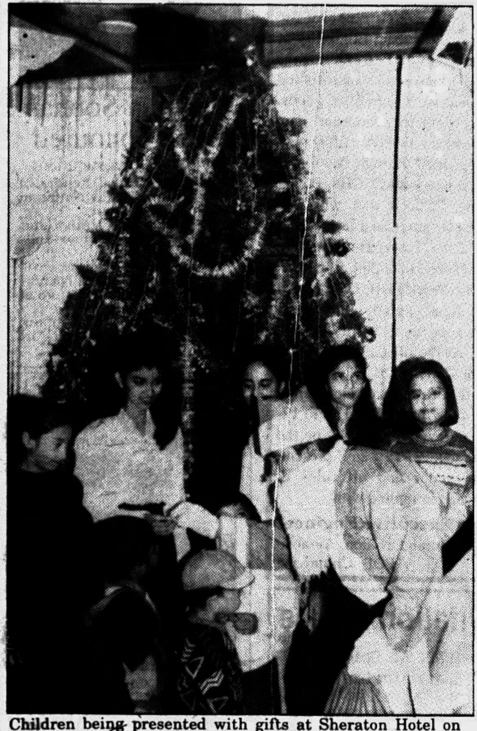
Children being presented with gifts at Sheraton Hotel on the eve of Christmas yesterday.

BNP Chairperson and Leader of the Opposition in Parliament Begum Khaleda Zia yesterday condemned the police raids on the residences of party MPs Salahuddin Quader Chowdhury and Gasuddin Quader Chowdhury, reports UNB. In a statement, she said the "fascist" government, failing to run the country and bartering away its independence and sovereignty, was now harassing the public representatives. Begum Zia said this government has filed thousands of false cases against political workers and the MPs, and was nakedly using the state machinery to serve its petty interests. See Page 12 Col 5