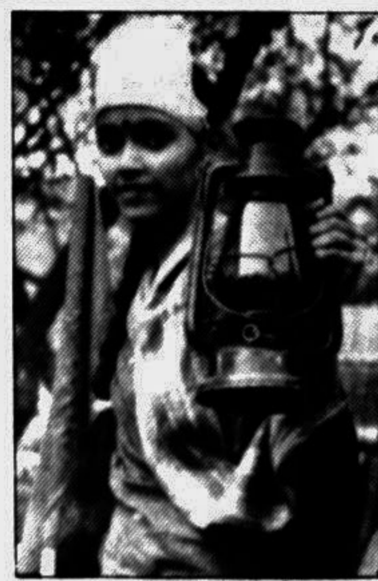
A procession in the city yesterday protesting loadshedding.

By Sharier Khan The Dhaka Electric Supply Authority (DESA) will introduce a computerised power monitoring system from May-June next to ensure stable power voltage, better management of loadshedding and services. The system, called Supervisory Control and Data Acquisition (SCADA), is now being installed at the DESA's Kataban office in the city under the Eighth Power Project, funded by the Asian Development Bank (ADB), according to sources in the DESA. Built at a cost of 16 million US dollars under a turn key contract with Swedish company Asca Brown Boveri (ABB) Network Control, SCADA will enable DESA to monitor the level of total power generation in the city round the clock from the Kataban office. If there is any power disruption in any area of the city, a wall to wall monitoring board connected with modem and computers will instantly show the location and the nature of problem. This will help DESA to take remedial measures immediately. DESA will be able to detect problems in any of its 9000 distribution lines. See Page 12 Col 1