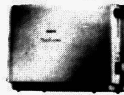
Toaster - 2 Slices