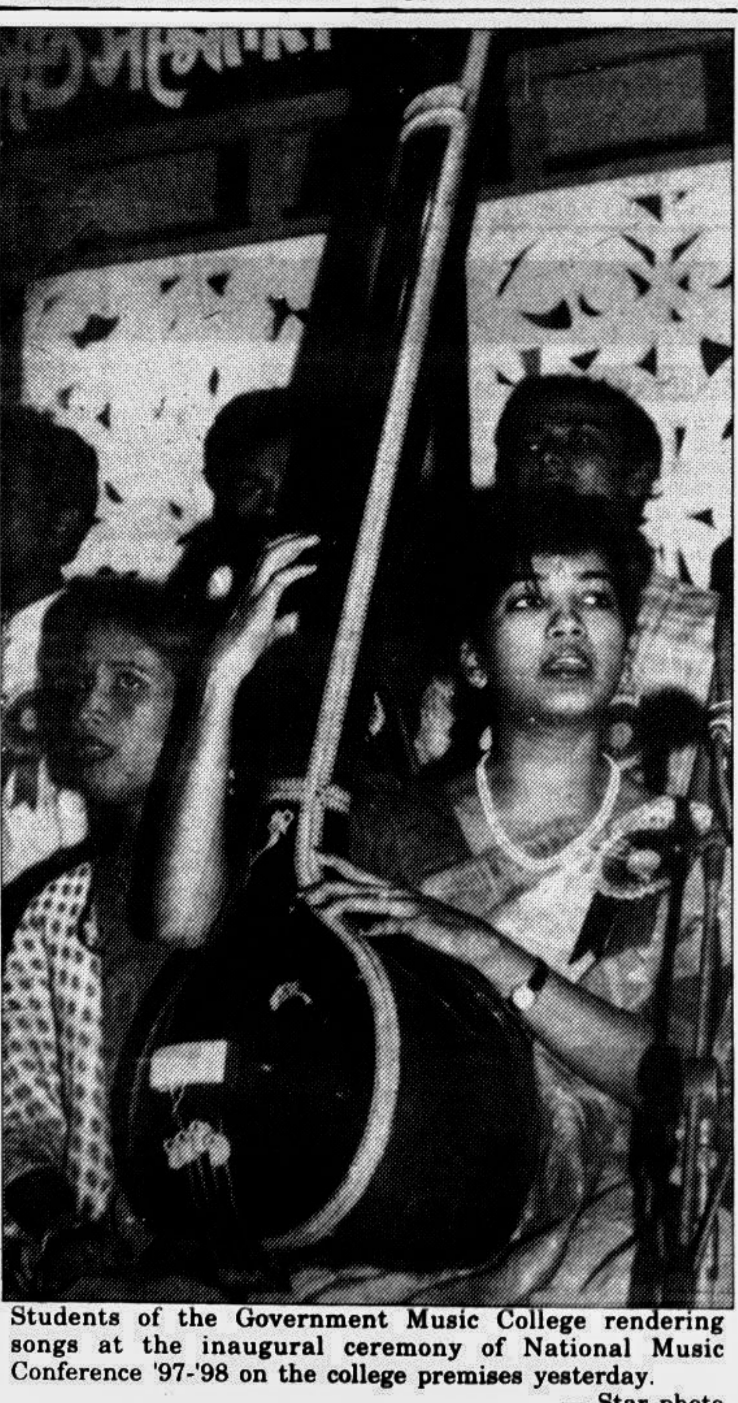
Students of the Government Music College rendering songs at the inaugural ceremony of National Music Conference '97-98 on the college premises yesterday.

Later, a press release issued from the Bangabhaban said that the President would talk to the authorities concerned about the BNP proposal for a government-opposition round-table.