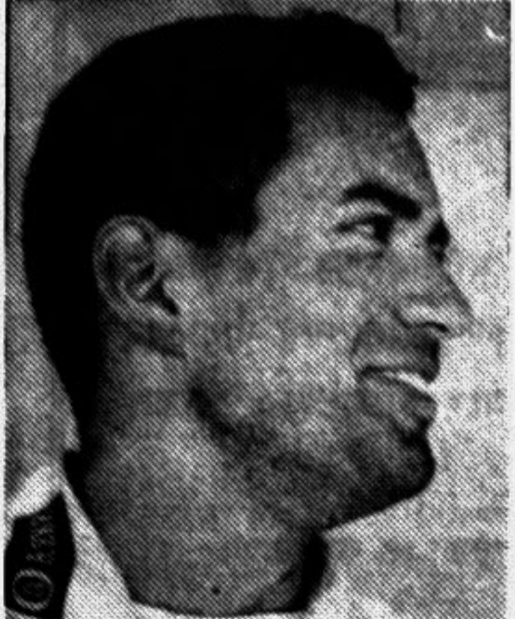
Adam Hollioake (England one-day cricket team captain) 'Whatever game I go into is the immediate priority for me.'