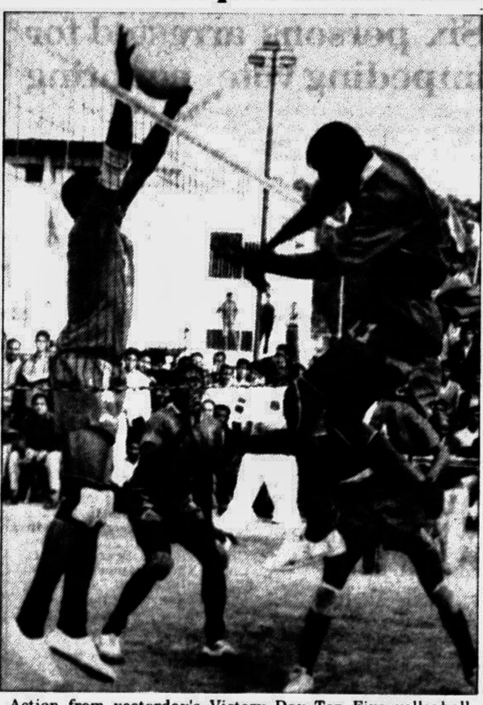
Action from yesterday's Victory Day Top Five volleyball tournament final between Bangladesh Rifles and Bangladesh Army at the court near Dhaka Stadium.

State Minister for Youth and Sports Obaidul Quader, who was the chief guest on the concluding day of the meet, distributed trophies among the winners. Besides, the president of Bangladesh Volleyball Federation, Maj. Gen. Mohammed Azizur Rahman was also present on the occasion.