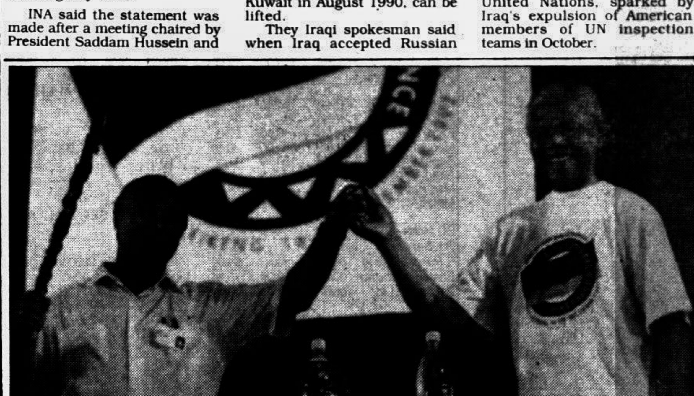
South African Deputy President Thabo Mbeki, left, the newly elected president of the African National Congress holds Nelson Mandela's hand up in the air while in his other hand he holds a walking stick that Nelson Mandela presented him with Saturday during the ANC's 50th general congress held in Mafeking.

mediation to defuse a crisis over weapons inspections it had in mind "to give a chance to deal with the cause of our people in an objective way that will lead to an end to the sanctions in a full and comprehensive manner." "We did not have in mind to end the crisis and push the cause of our people only into dark tunnels of ill-intentioned parties in the Security Council," the statement added. Russia brokered an agreement with Baghdad in November to defuse the crisis with the United Nations, sparked by Iraq's expulsion of American members of UN inspection teams in October.