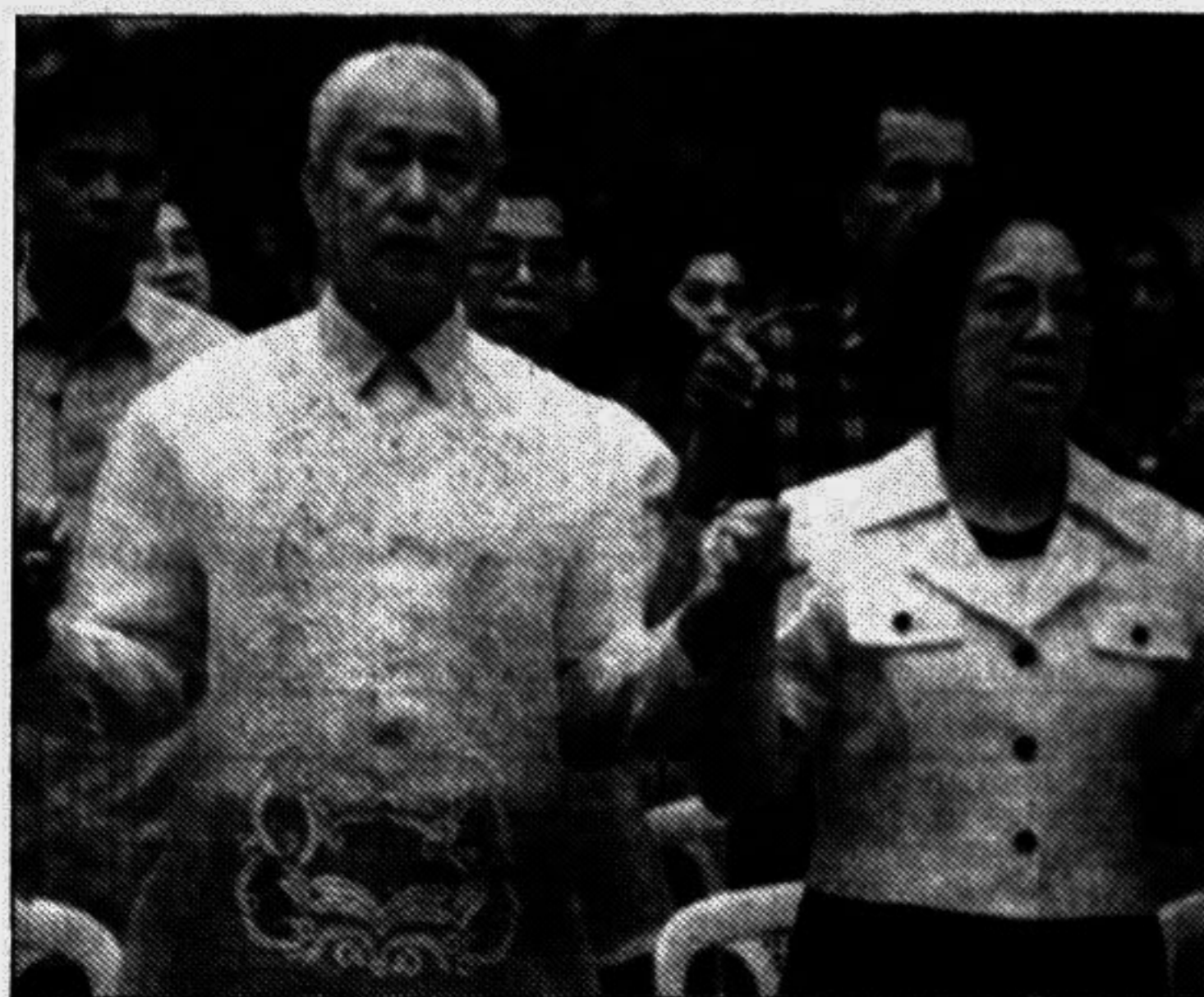
Former President Corazon Aquino joins hands with Manila Mayor Alfredo Lim, who is celebrating his 68th birthday, during a mass yesterday at the Manila City Hall. Lim a lawyer and former police general became known as the "Dirty Harry of the Philippines" for his tough-talk and equally tough measures against criminals which critics claim violate human rights. Lim declared his ambition to run in the May 1998 presidential election.

Laotians vote for new parliament: With all the candidates approved in advance by the ruling communist party, Laotians voted Sunday for a new parliament that is expected to continue gradual changes toward a more open economy, AP says from Vientiane.