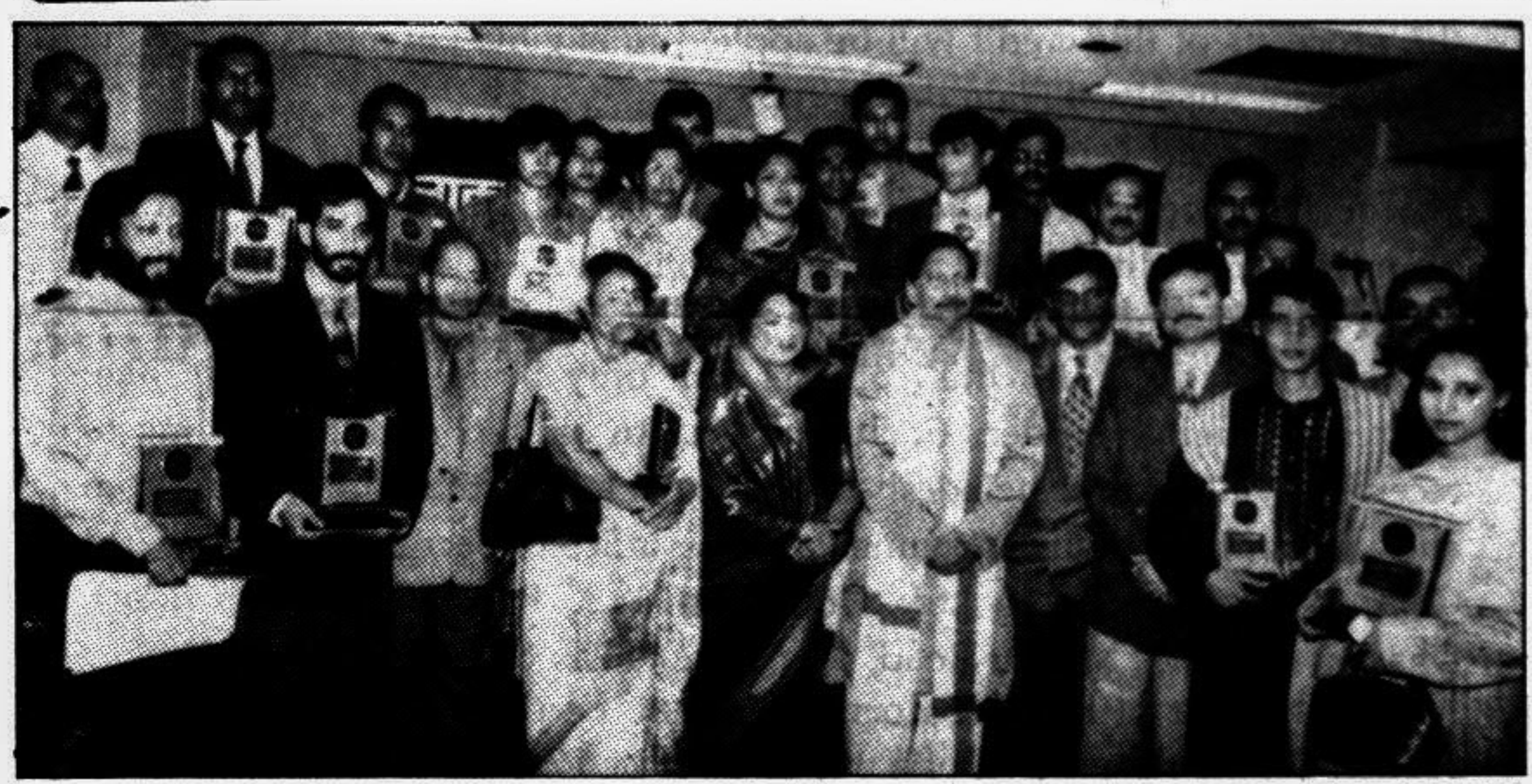
State Minister for Information Prof Abu Sayeed with the winners of Lux-Anyadin Eid Fashion Competition at a city hotel yesterday.

Occidental allowed the BR to operate trains after more than five months, on November 26. Since then, as asked by Occidental, train service was suspended eight times for a total of 11 days. Railway sources pointed out.