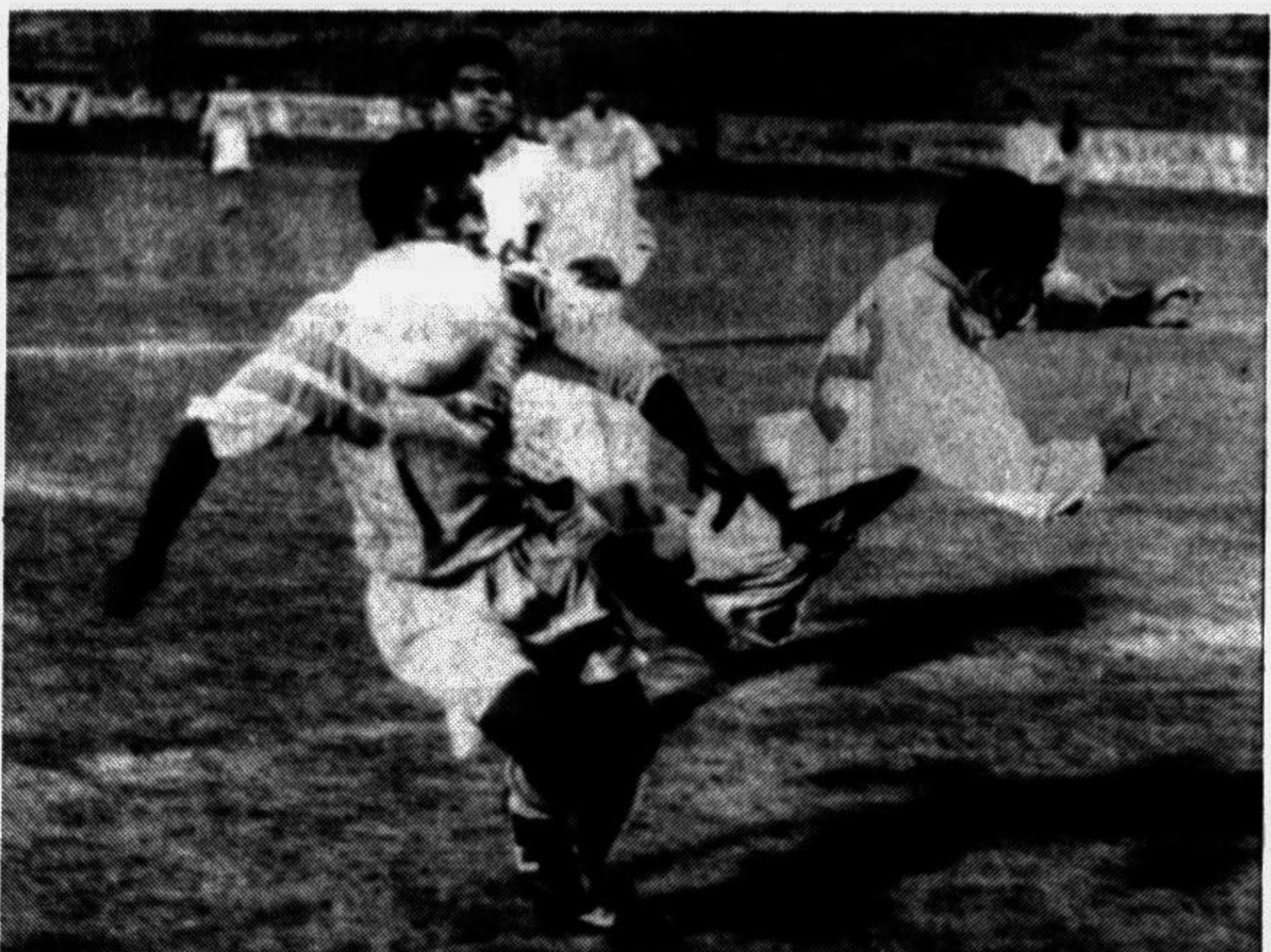
Action from Premier Division league encounter between Abahani and Farashganj at the Mirpur Stadium yesterday.

The Victory Day sports competition of Physical Education College was held at the college ground in the city yesterday, reports UNB. State Minister for Youth and Sports Obaidul Kader distributed prizes. TODAY'S MATCHES Janakantha Premier Division Cricket League: Agrani Bank SC vs Surjo Taran Club (BKSP) Wari Club vs Victoria SC (Dhanmondi Cricket Stadium) First Division Cricket League: Bangladesh Boys Club vs Bangladesh Railway: (City Club) First Division Football League: Badda Jagarani vs BRTC SC (Mirpur Stadium, 2 pm)