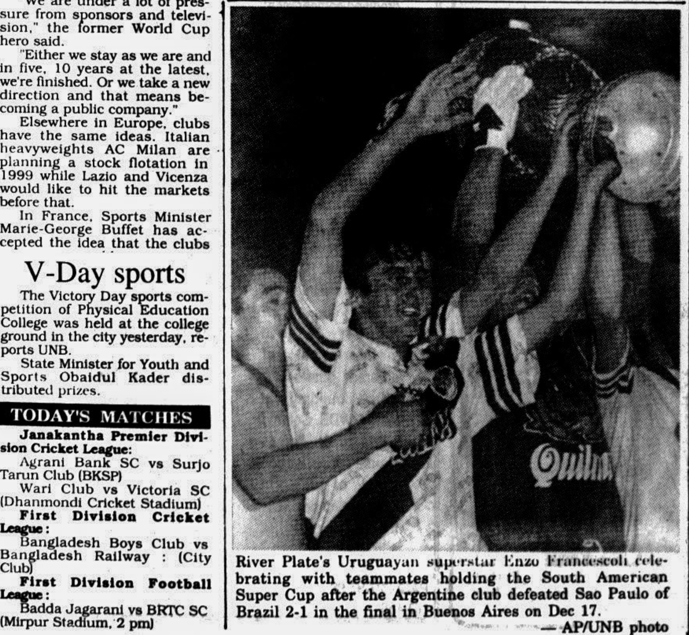
River Plate's Uruguayan superstar Enzo Francescoli celebrating with teammates holding the South American Super Cup after the Argentine club defeated Sao Paulo of Brazil 2-1 in the final in Buenos Aires on Dec 17.