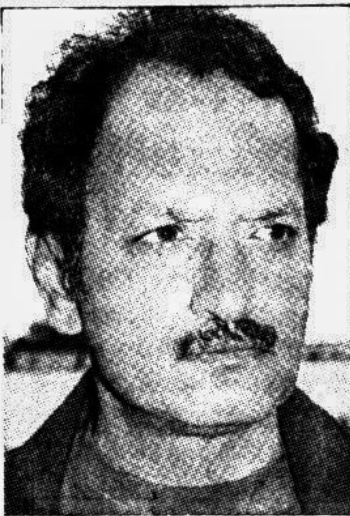
Ajit Wadekar (Former Indian cricket manager) "The job I like best in cricket is that of the manager."