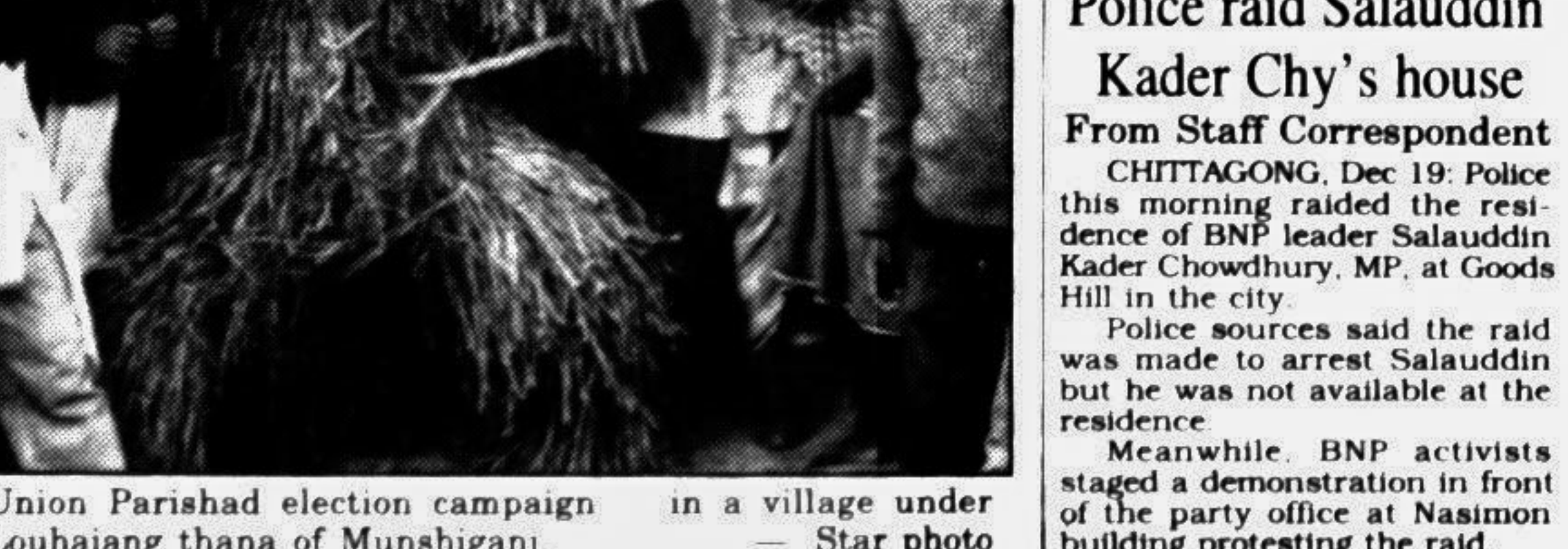
Union Parishad election campaign in a village under Louhajang thana of Munshiganj.