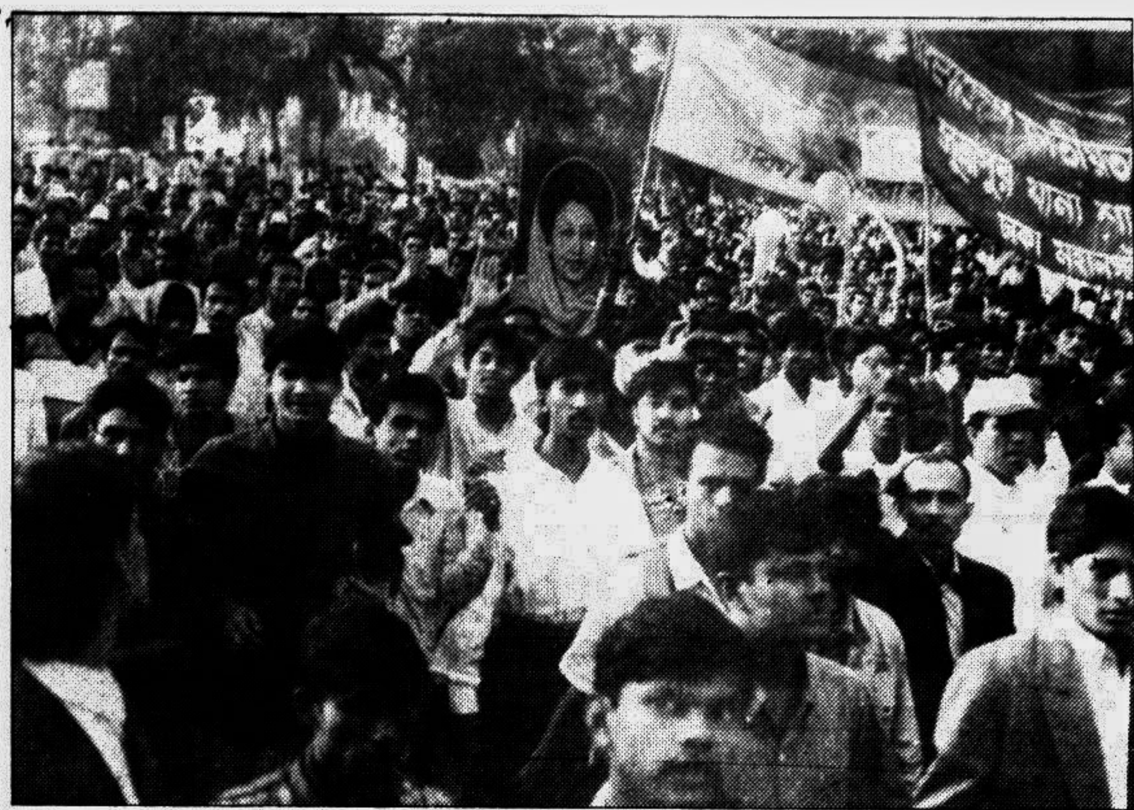
Bangladesh Nationalist Party (BNP) started Victory Day rally from Ramna Shatayu Angan on Tuesday.

Level - I (One) Completed Roll Nos. 59 (Fifty nine): 10091, 10333, 10576, 10577, 10735, 10789, 10834, 10835, 10836, 10852, 10895, 10940, 10950, 10957, 11000, 11016, 11065, 11079, 11096, 11103, 11107, 11135, 11145, 11147, 11214, 11217, 11221, 11249, 11273, 11276, 11283, 11284, 11304, 11338, 11349, 11315, 11319, 11324, 11327, 11338, 11385, 11389, 11390, 11392, 11404, 11405, 11420, 11429, 11430, 11442, 11513, 11582, 11604, 11688, 11690, 11771, 11790, 11833, 11939.