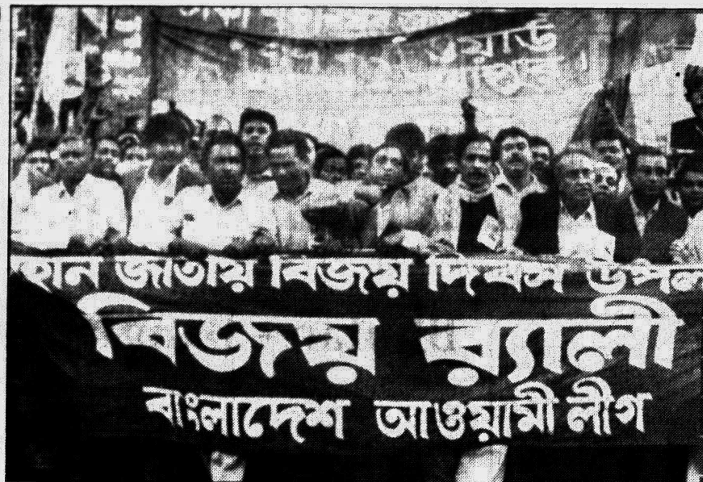
Victory Day rally of the Bangladesh Awami League in the city on Tuesday.

Different socio-political and cultural organisations placed wreaths at the National Memorial at Savar to mark the Victory Day on Tuesday. From top: Bangladesh Jatiyatabadi Dal, Awami League, Dhaka University, Muktiyoddha Sangsad, Projonmo '71, Gano Forum, Jatiya Party and Left Democratic Front. — Star photos