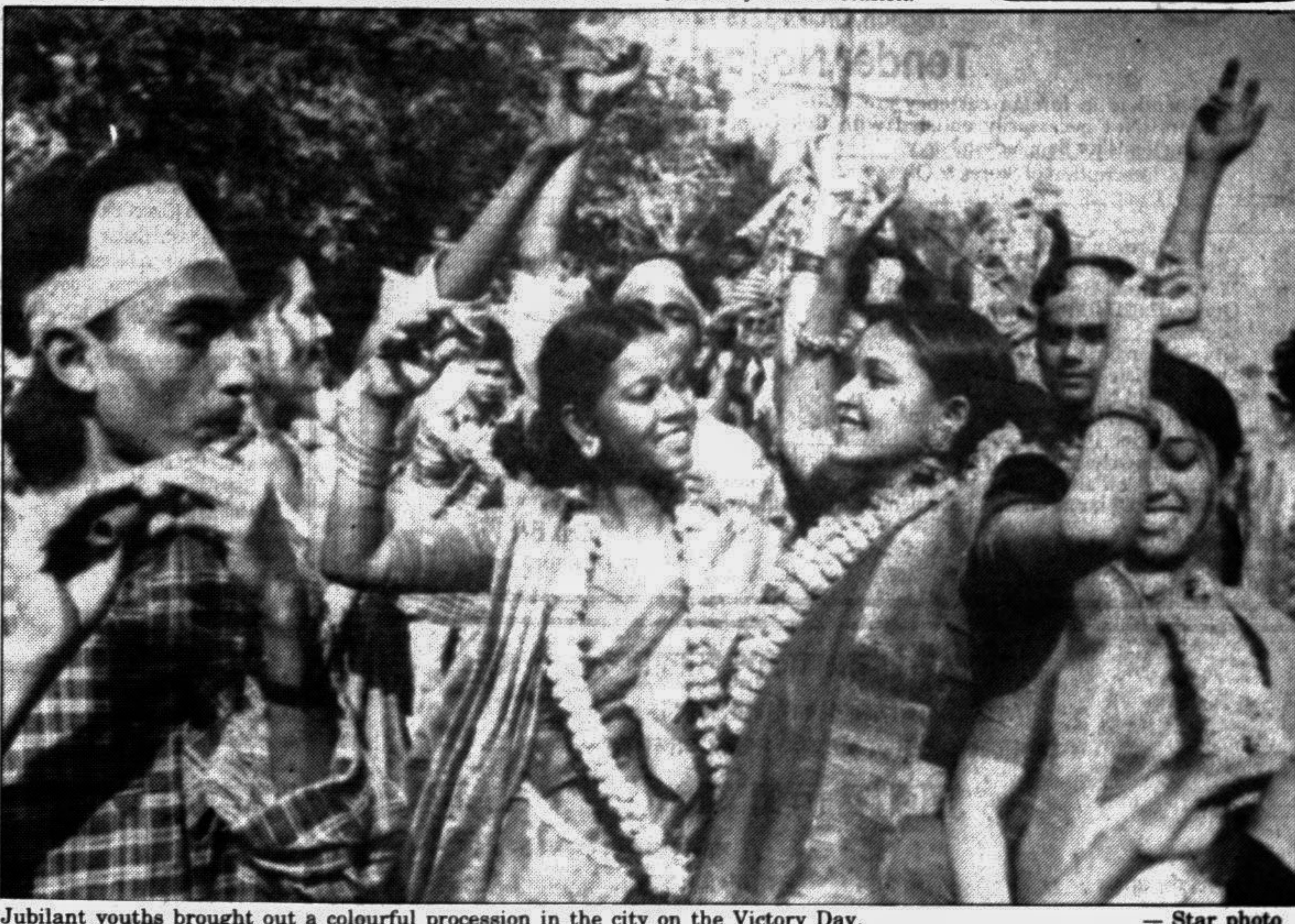
Jubilant youths brought out a colourful procession in the city on the Victory Day.

Officials of the European Union are expected to review next month its temporary ban on export of Bangladesh frozen fish to EU member countries, sources concerned said. A three-member EU team yesterday completed its 7-day inspection of the fish processing plants and quality control laboratories in Khulna and Chittagong, officials said. The team will sit today with fisheries officials in Dhaka to discuss quality control arrangements in the country. The EU Veterinary Committee is expected to call a meeting in Brussels next month to review quality of Bangladesh's exportable fish.