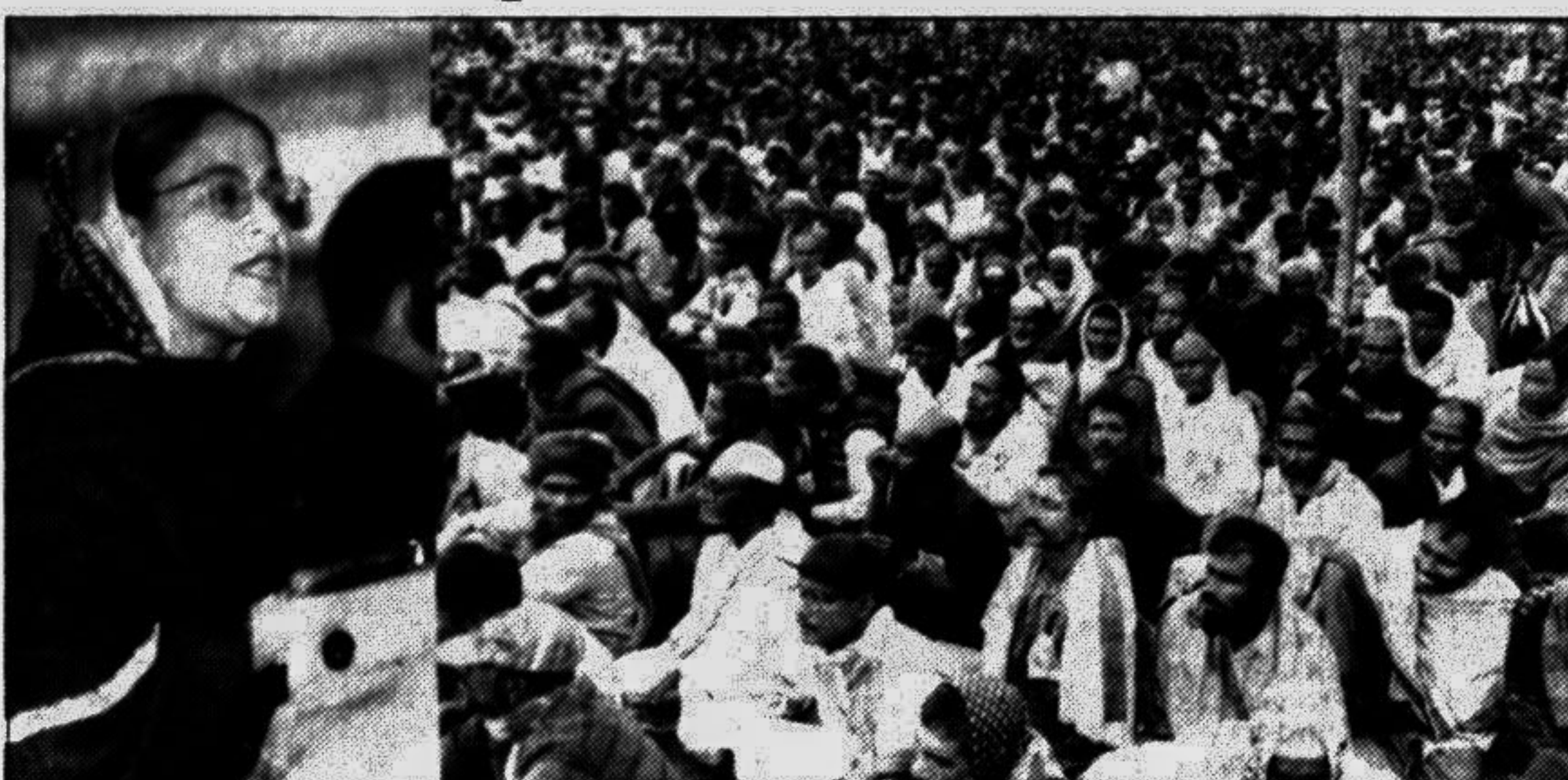
Prime Minister Sheikh Hasina addressing a grand rally of the Bangladesh Muktiyoddha Sangsad Central Command Council at Paltan Maidan in the city yesterday.

The winners have been requested to collect their prizes before Dec 25 from the WVA office at House: 20, Rd: 16, Dhanmondi in the city, says a press release.