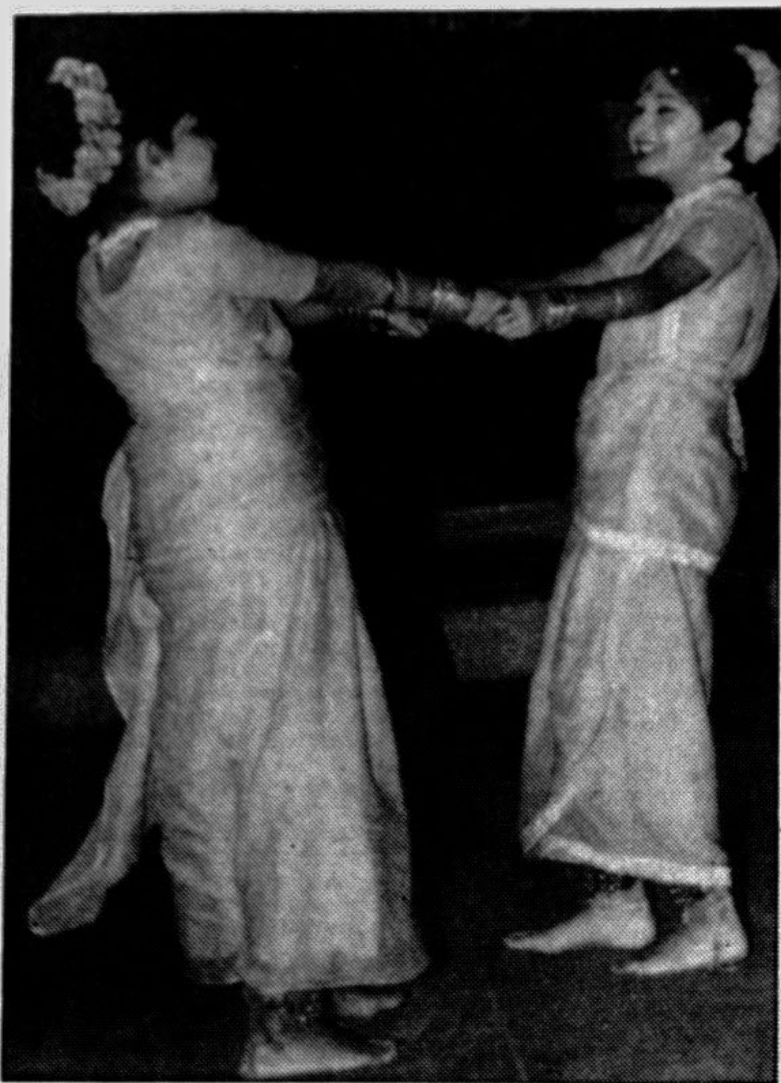
Child artistes performing at Sammito Sangskritik Jote's 'Bijoy Utsab '97' at the Central Shaheed Minar in the city yesterday.