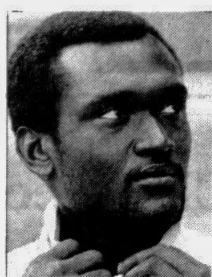
HOOPER ... 100 n.o

Brown clean bowled Philo Wallace first ball, beat Lara outside the off-stump with the