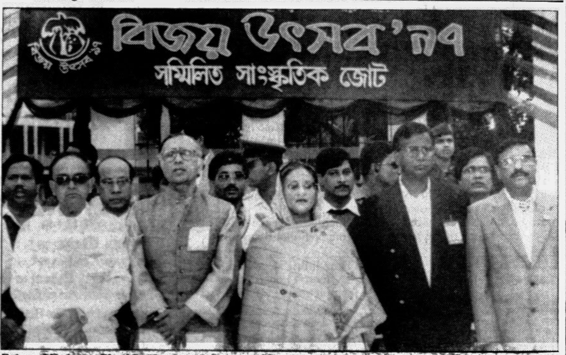
Prime Minister Sheikh Hasina and members of the Sammilita Sangskritik Jote observing one minute's silence in memory of the martyrs of Liberation War before she inaugurated 'Bijoy Utsab '97' at the Central Shaheed Minar in the city yesterday.

Experts and officials of the Law Ministry and the Special Affairs Division, now engaged in preparing the drafts of new laws on CHT, were learnt to have been advised to complete their job within a month, reports UNB. Sources said as many as four new laws would be formulated to give legal cover to the CHT peace accord, signed on December 2 between the government and tribal leaders. Three bills to amend the three hill districts (Khagrachhari, Rangamati and Bandarban) local govt councils acts of 1989 and one new bill on the proposed Regional Council will be prepared. The bills will be submitted for the Parliament's winter session which is expected to begin in the first week of January. After the passage of the bills in parliament, the sources said, government would take up other steps like formation of the Land Commission and interim Regional Council for the Hill Tracts in accordance with the provisions of the peace agreement. Meanwhile, preparations are also underway to make a list of the armed cadres of Parbatya Chattagram Jana Sanghati Samity (PCJSS).