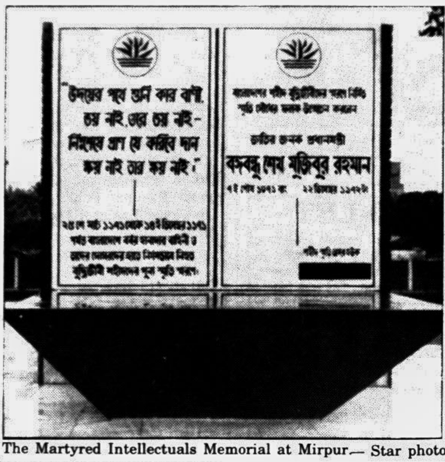
The Martyred Intellectuals Memorial at Mirpur

By Staff Correspondent A grateful nation today pays homage to the celebrated sons of the soil who were brutally murdered by the Pakistani occupation forces and their local collaborators at the fag end of the nine-month War of Liberation. Today is Martyred Intellectuals Day. This day in 1971, many leading intellectuals of the country were killed by the occupation forces and their local agents with the ulterior motive of making the emerging nation intellectually bankrupt. The infamous collaborators — Al-Badr, Al-Shams and Razakars — had picked up many teachers, writers, philosophers, doctors, poets, engineers, journalists and other intellectuals, mostly from their respective residences, and murdered them. They were tortured at various concentration camps and eventually butchered and their bodies were dumped at two places in the city — Rayerbazar and Mirpur. Their mutilated bodies, with hands tied behind